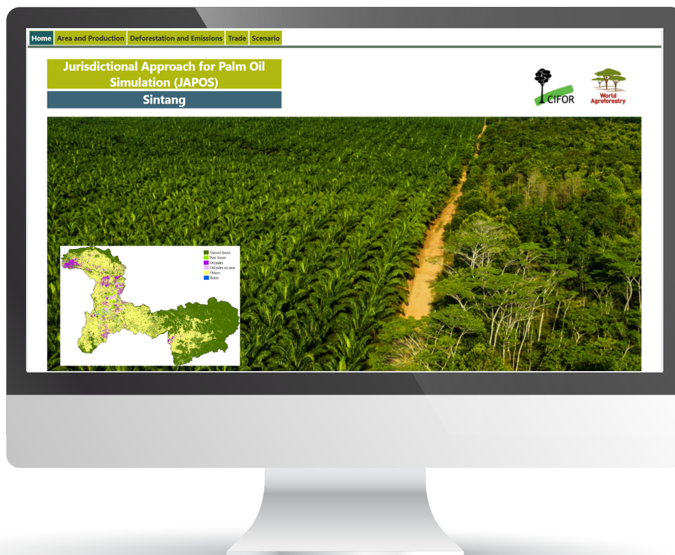
Figure 1. The JAPOS user interface for Sintang Regency

JAPOS (Jurisdictional Approach for Palm Oil Simulation) is a value chain dynamics approach-based modelling tool designed to simulate scenarios for sustainable palm oil policies and their impacts on economic and ecological values at the subnational/regency level. JAPOS is displayed in a web-based application that can be used as a simulation tool for analysis, studies or decision-making processes in policy formulation in specific regencies (Figure 1).