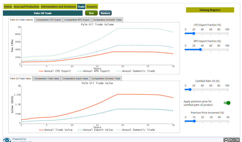
Figure 5. Palm oil trade simulation page

Users can experiment with scenarios for export ratio, certified palm oil trade and premium price implementation, and study their impacts on palm oil trade volume and economic value (Figure 5).