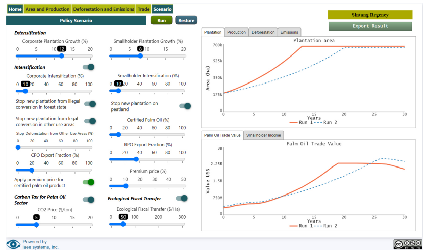
Figure 6. Policy scenario combinations simulation page

Users can perform simulations based on various combinations of scenarios as needed, and study the impacts of these scenarios on various outputs, for example environmental outputs (plantation area, palm oil production, deforestation and emissions) and economic outputs (palm oil trade value and farmer income) (Figure 6).