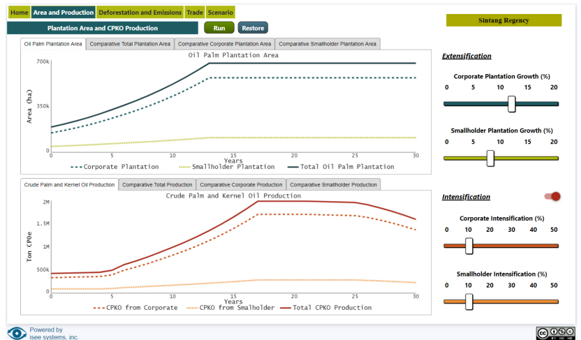
Figure 3. Area and production simulation page

Users can experiment with scenarios for the magnitude of extensification and/or intensification rates of large plantations and smallholder plantations and study their impacts on oil palm plantation area and palm oil production (Figure 3).