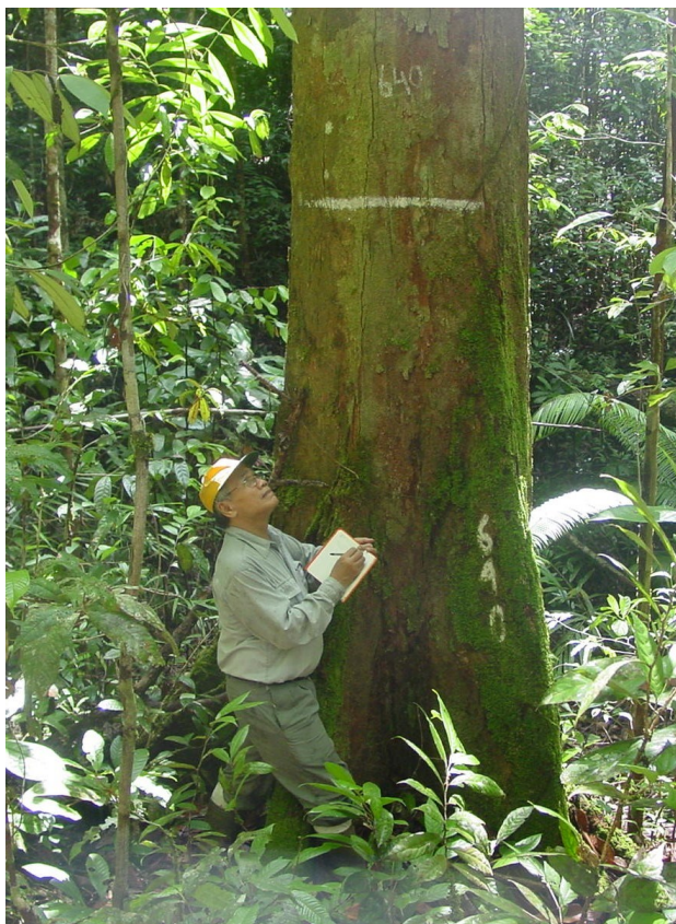
Fig. 4. At the research forest site in Seturan, Kabupaten Malinau, 2003.