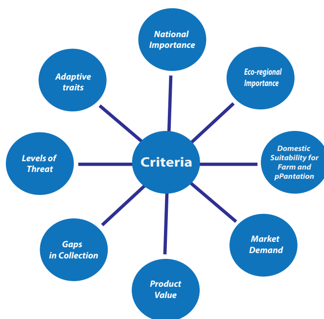
Figure 1: Stakeholders' preference of species selection criteria for tree domestication