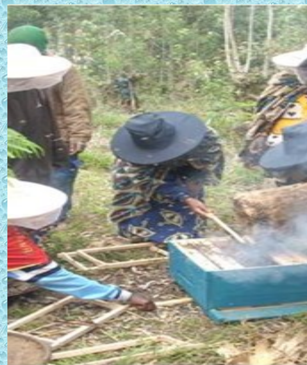
Ibikorwa bizamura imibereho myiza 'abaturage