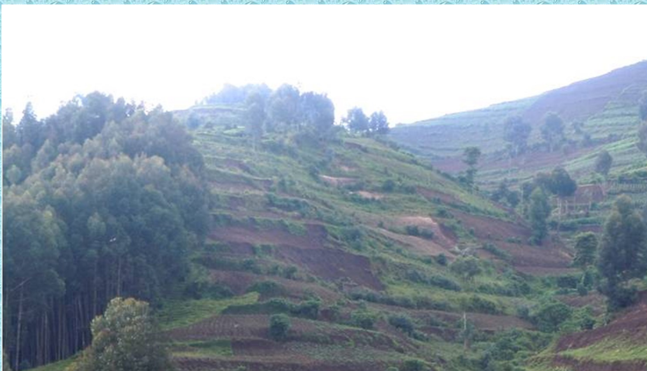
Isuri ku misozi ihanamye