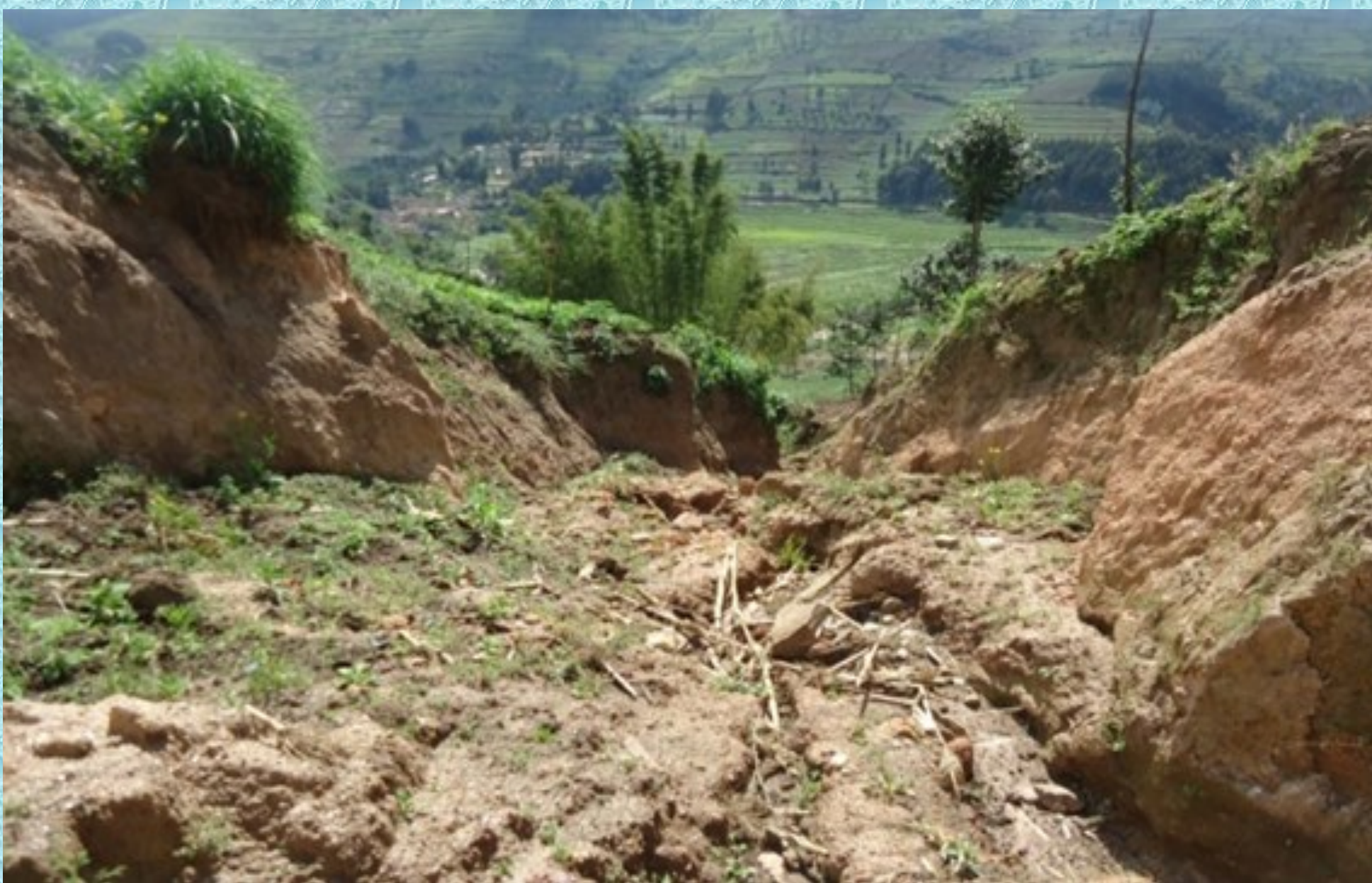
Isuri iterwa n'amazi y'imvura