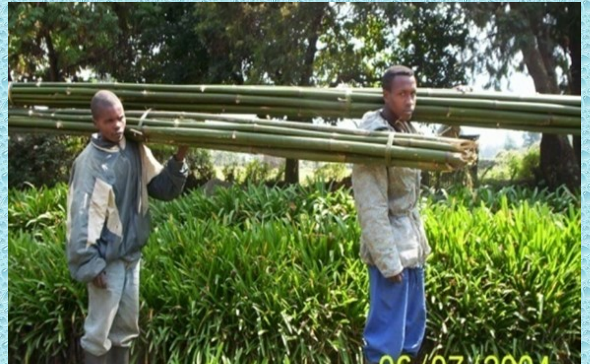
Iyangizwa rya Pariki