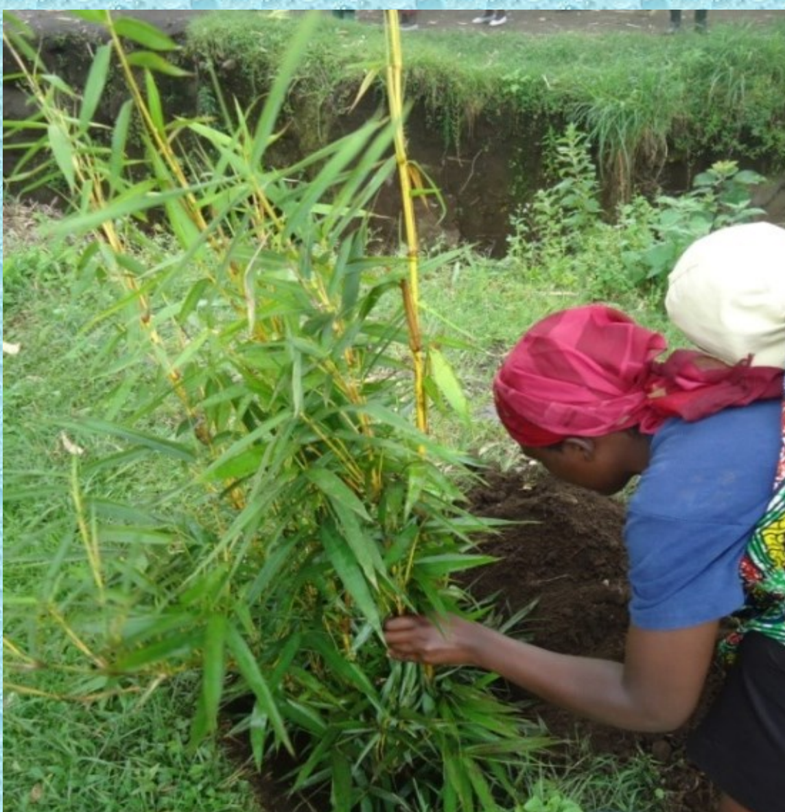
Kurwanya isuri haterwa imigano n'ibiti bivangwa n'imyaka