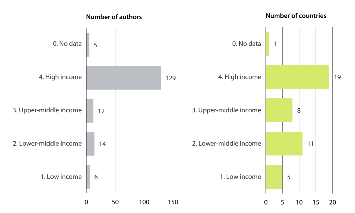
Figure 2. Number of authors by country income classification

Note: As of 31 December 2018; observations=111. Two publications had no data because the authors were listed as 'Anonymous'.