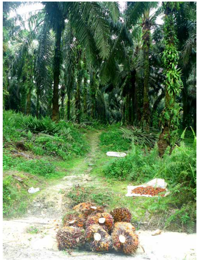
Harvested oil palm fruits at the plantation edge

The SPOP project demonstrated that perceptions of sustainability and global challenges vary greatly among micro- and macro-actors and between both types of actors. Differentiation between local and global scales in defining and implementing strategies toward sustainability is also crucial in terms of time scale. Macro-actors tend to target actions in a short timeframe for immediate results, while local populations plan their actions and strategies over a lifetime. These diverging conceptions of sustainability dimensions, (i.e. regarding the inter-relationship of the three pillars and varying time scales and priorities when confronting local and global issues) influence the way good practices and potential actions may be defined and applied in the field. A lack of consideration and mediation between both points of view (i.e. local and global by micro- and macro-actors respectively) is most likely to induce bottlenecks and barriers in the definition and implementation of good practices and these perspectives should be therefore accounted for in the refinement of sustainability criteria.