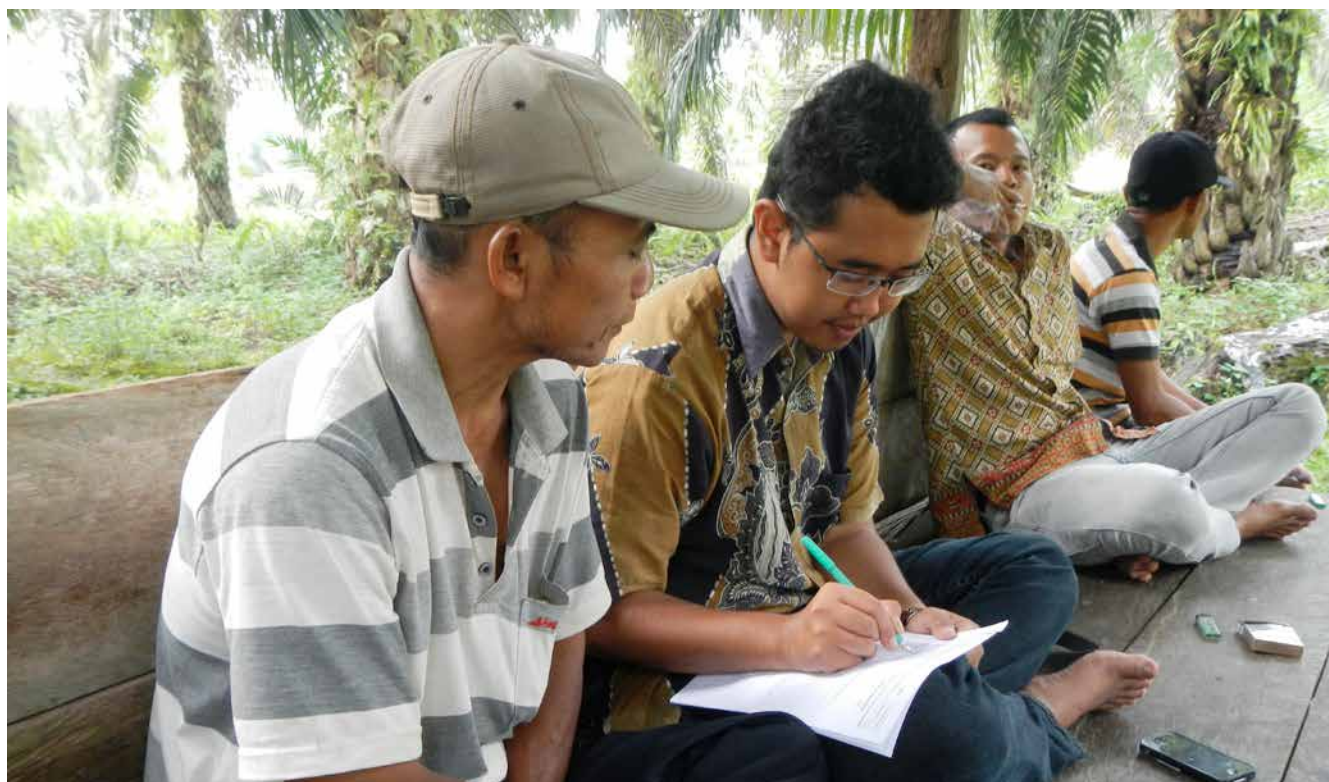
Smallholder interview in Sumatra, Indonesia, within the SPOP project

systems can be found, ranging from the family plot of 1–2 ha to agro-industrial estates with plantation blocks and extraction mills.