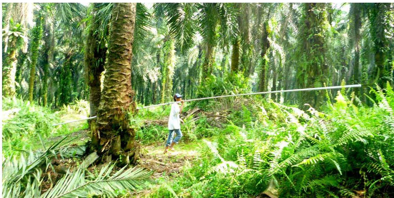
Fruit harvester in an oil palm plantation in Indonesia

Understanding the differentiated strategies of the multiplicity of oil palm growers is crucial in order to identify the scope of improvement required in oil palm production practices and household strategies, notably in terms of financial loans. This understanding is also essential to make recommendations adapted to different growers' needs, which are more likely to be efficient in the field. Strategies, successes and impacts on household livelihood are highly dependent on the local context and on growers' rationale (Baudoin et al. 2015). This diversity in smallholder production systems should be taken into account by the main players when defining national strategies or certification schemes.