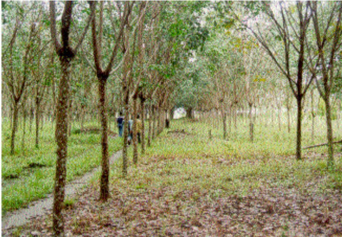
Smallholder Rubber Plantation, Jambi.

The public was not consulted when local regulations were formulated. This contradicts recommendations in Article 68 of national Forestry Law No. 41, issued in 1999, and Article 24 (5) of Act No. 34, issued in 2000, regarding Regional Taxes and Retributions (see section C).