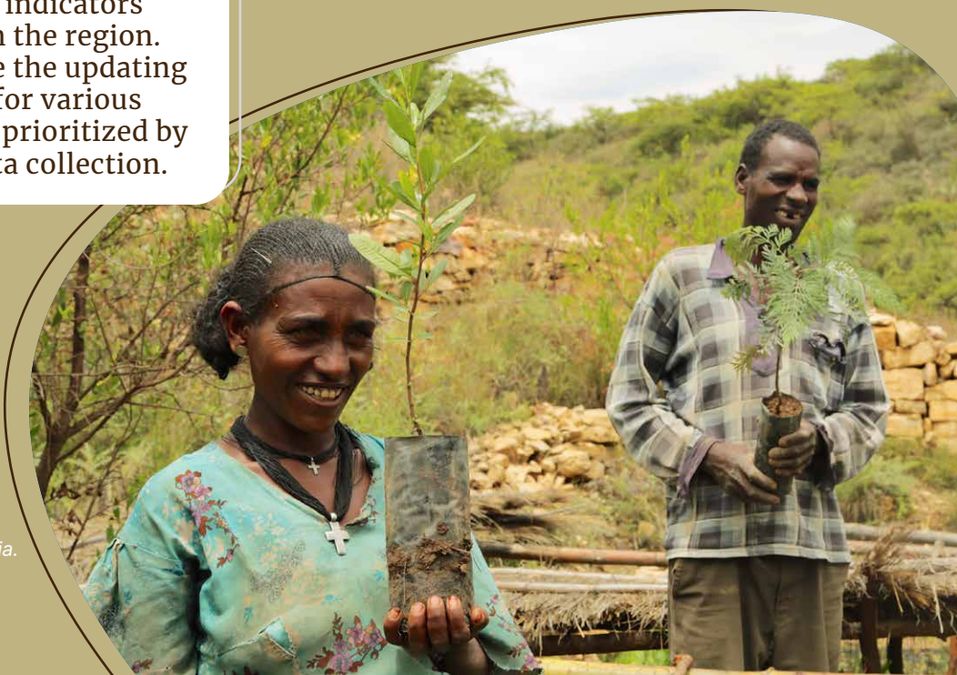
Forest landscape restoration in Ethiopia.

OFESA's database provides information on country-specific drivers of deforestation in Kenya, Uganda, Tanzania and Mozambique, and will be updated to include Ethiopia. The information includes how the indicators are monitored, and who is doing the monitoring.