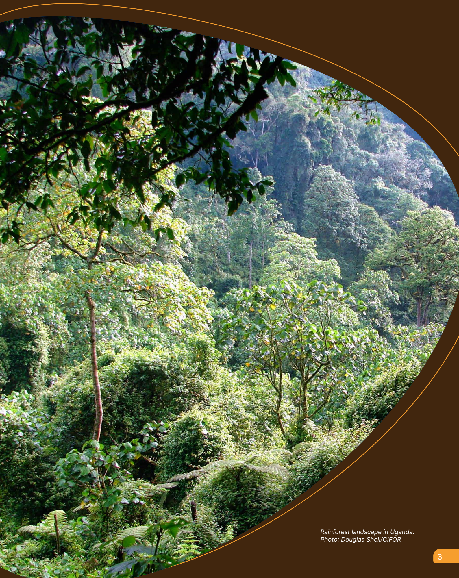
Rainforest landscape in Uganda.