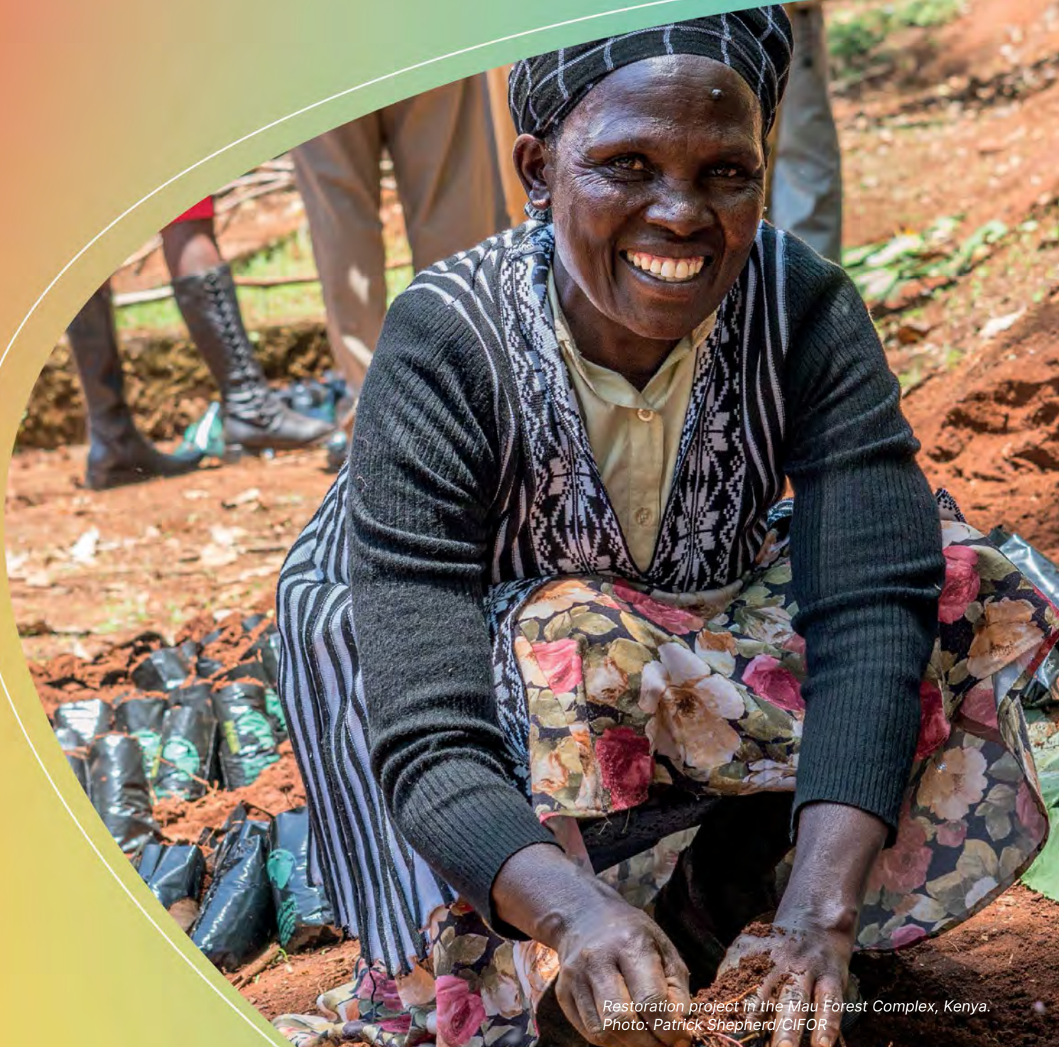
Restoration project in the Mau Forest Complex, Kenya.