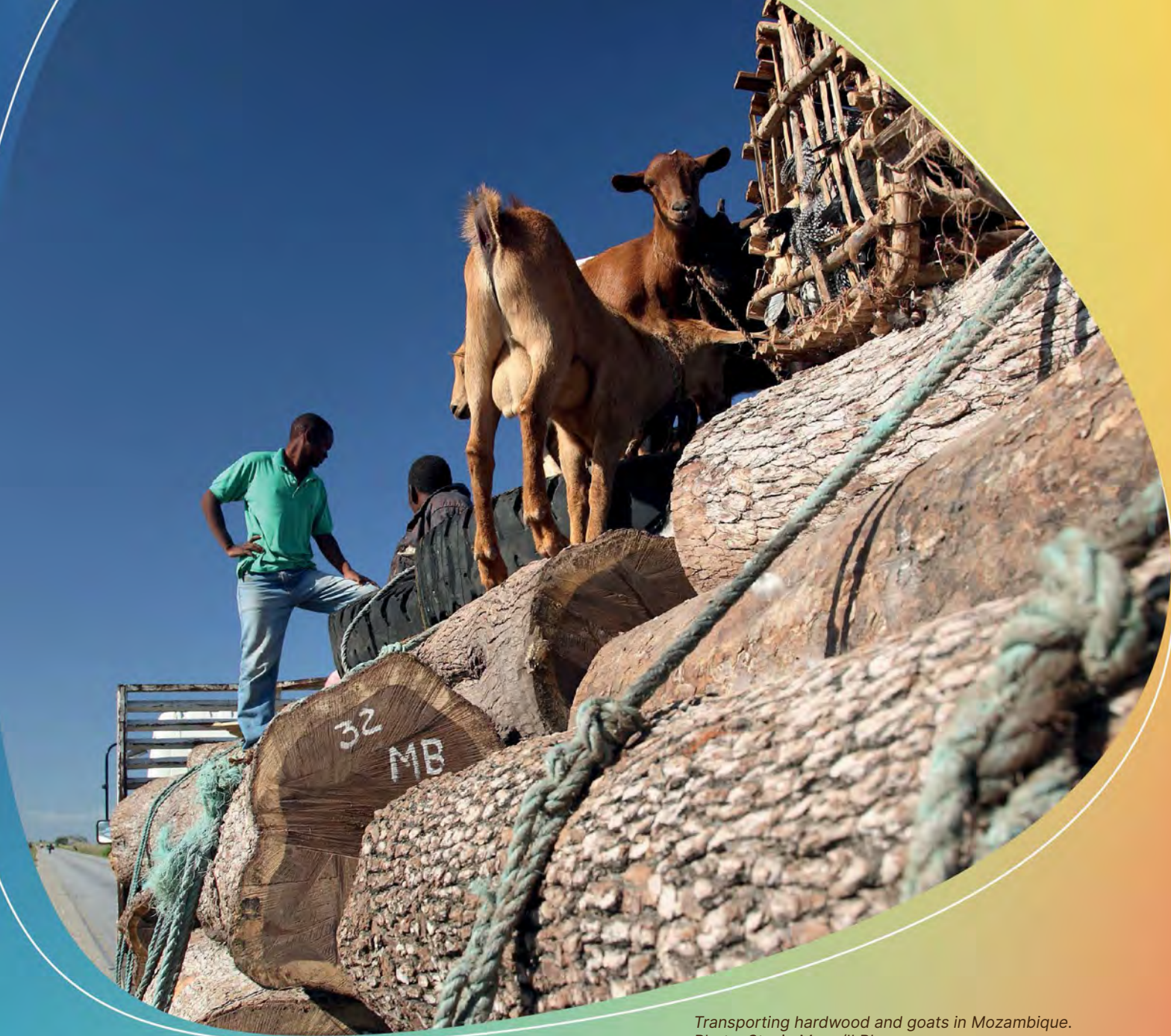
Transporting hardwood and goats in Mozambique.

To learn more about the East and Southern Africa Forest Observatory, please visit: