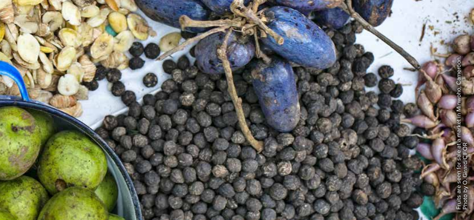
Fruits are seen for sale at a market in Minwoho, Cameroon.