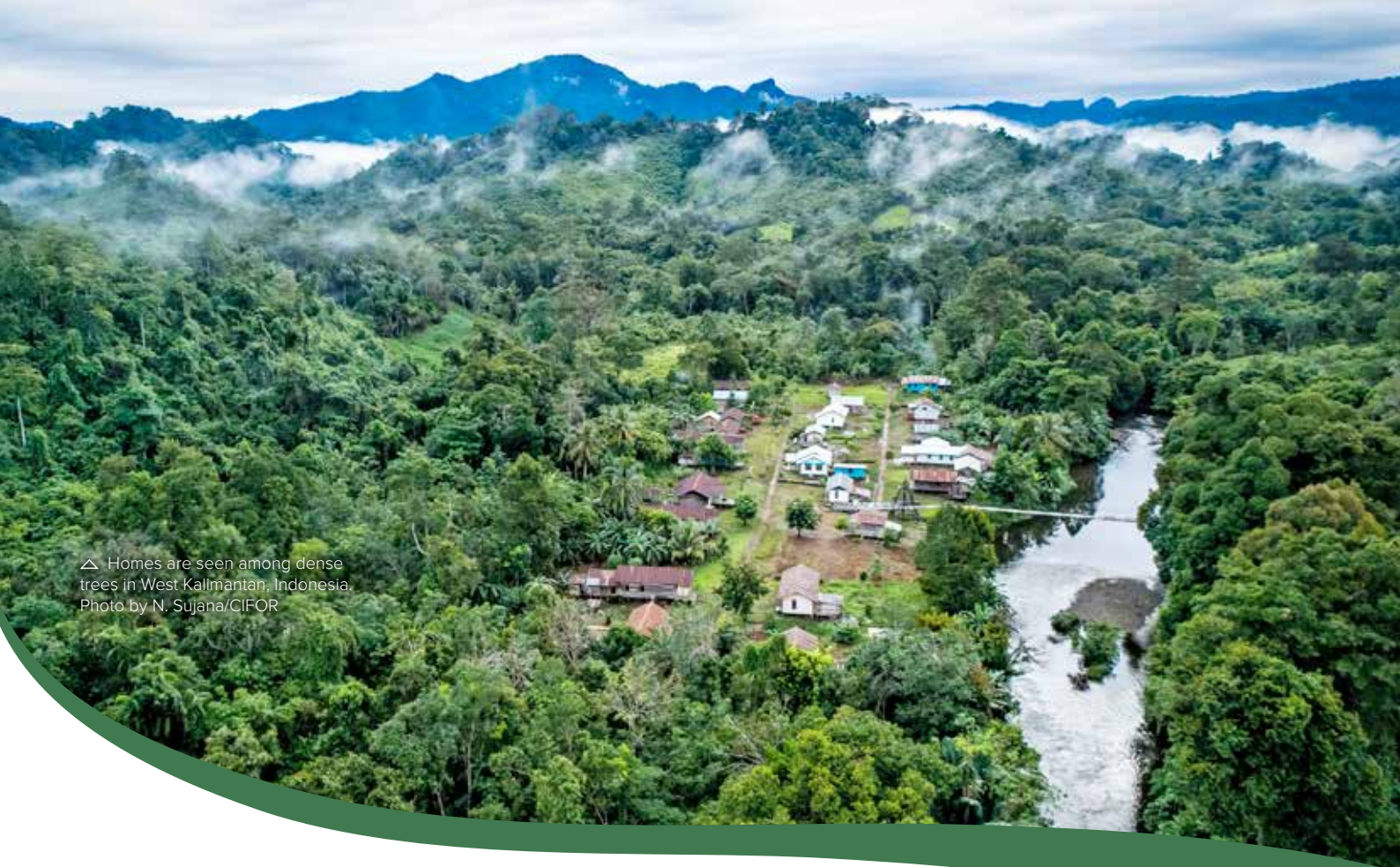
△ Homes are seen among dense trees in West Kalimantan, Indonesia.