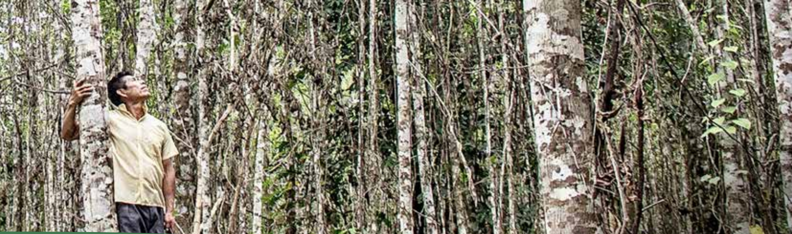
△ A grower assesses bolaina in an agroforestry system in Peru.