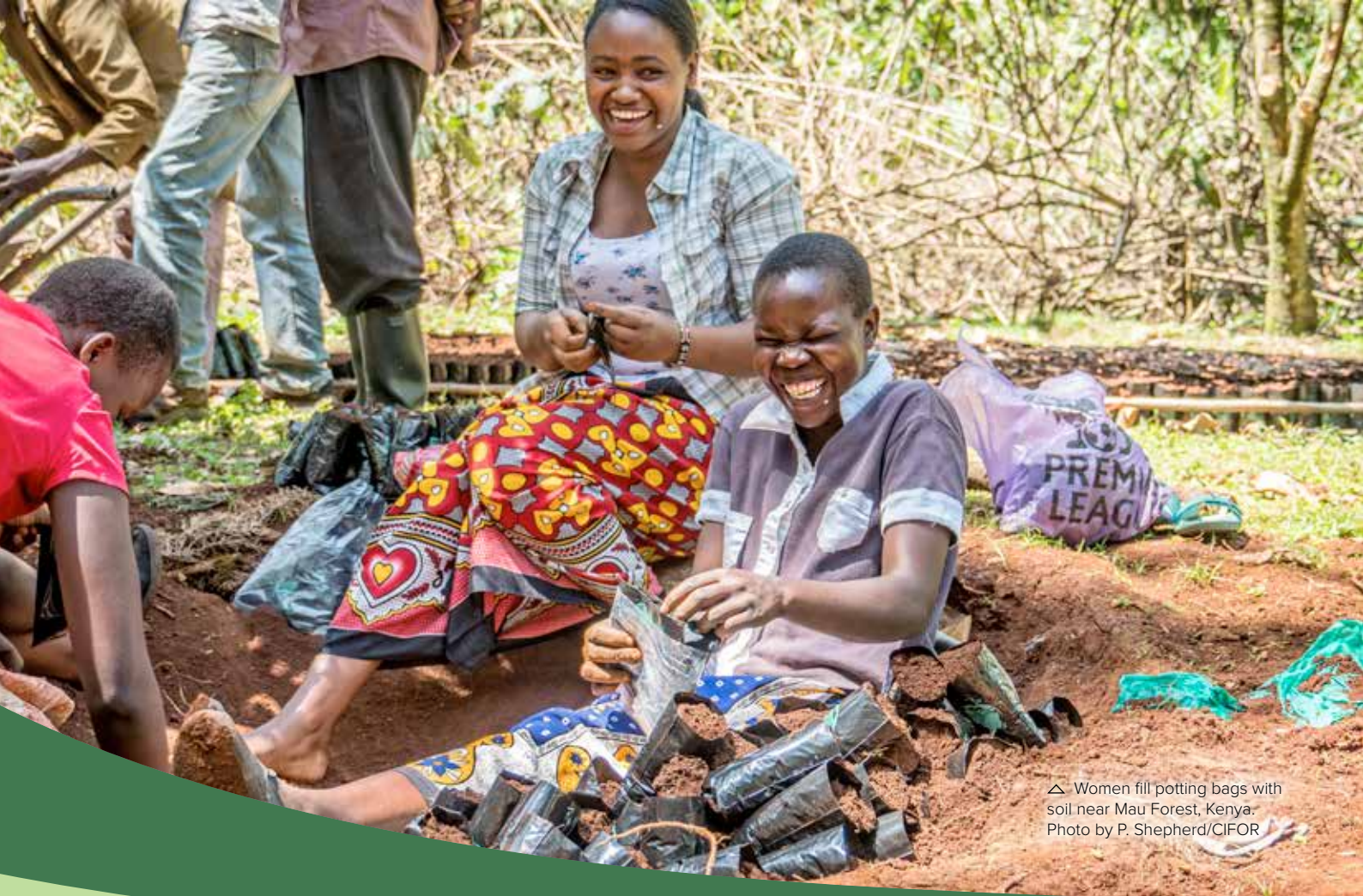
△ Women fill potting bags with soil near Mau Forest, Kenya.