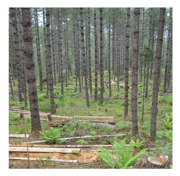
Harvest operation in a community forest near to UWICER center, Bhutan.