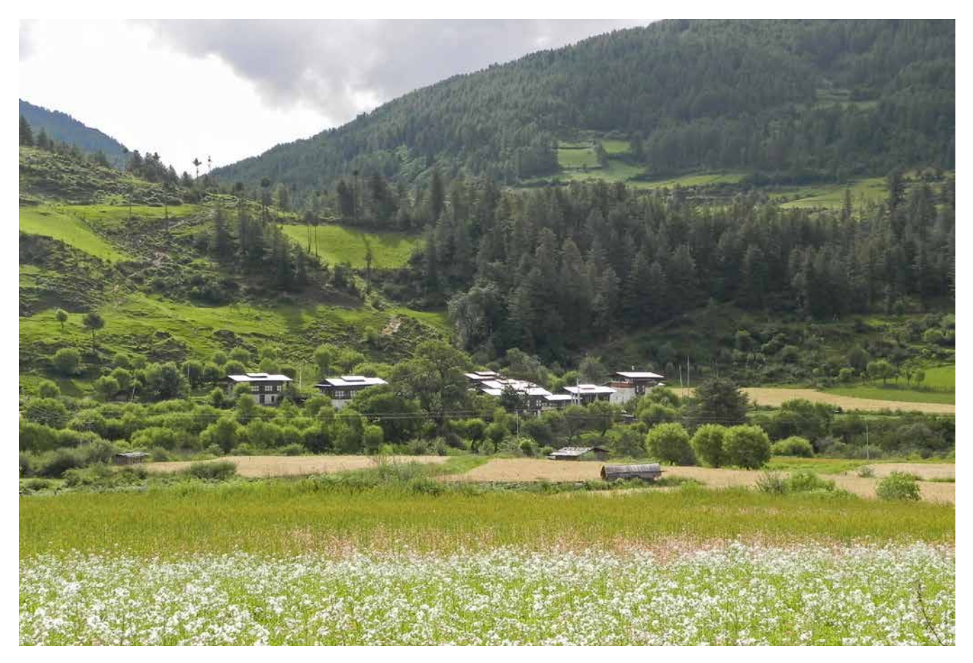
Agrarian landscape in the Tang Valley, Bumthang, Bhutan.

An ongoing concern for the government is to protect Bhutan's fragile mountain ecosystem, while providing a continuous supply of sustainably harvested forest resources to residents and businesses. Multiple policies relate to landscape management, including the National Forest Policy and the National Environment Strategy. These policies prioritize an integrated landscape approach to forest management, balancing forest conservation with sustainable use of forest resources. They recognize that landscape stewardship by upstream land and natural resource users is critical to downstream residents and water users. Thus, the government is calling upon residents of the upland landscapes in mountain regions, who are the farmers and herders, to shift their land use toward practices that favor forest cover restoration or conservation. These practices should have a distinct emphasis on water management, with respect to both overland flow and groundwater stores.