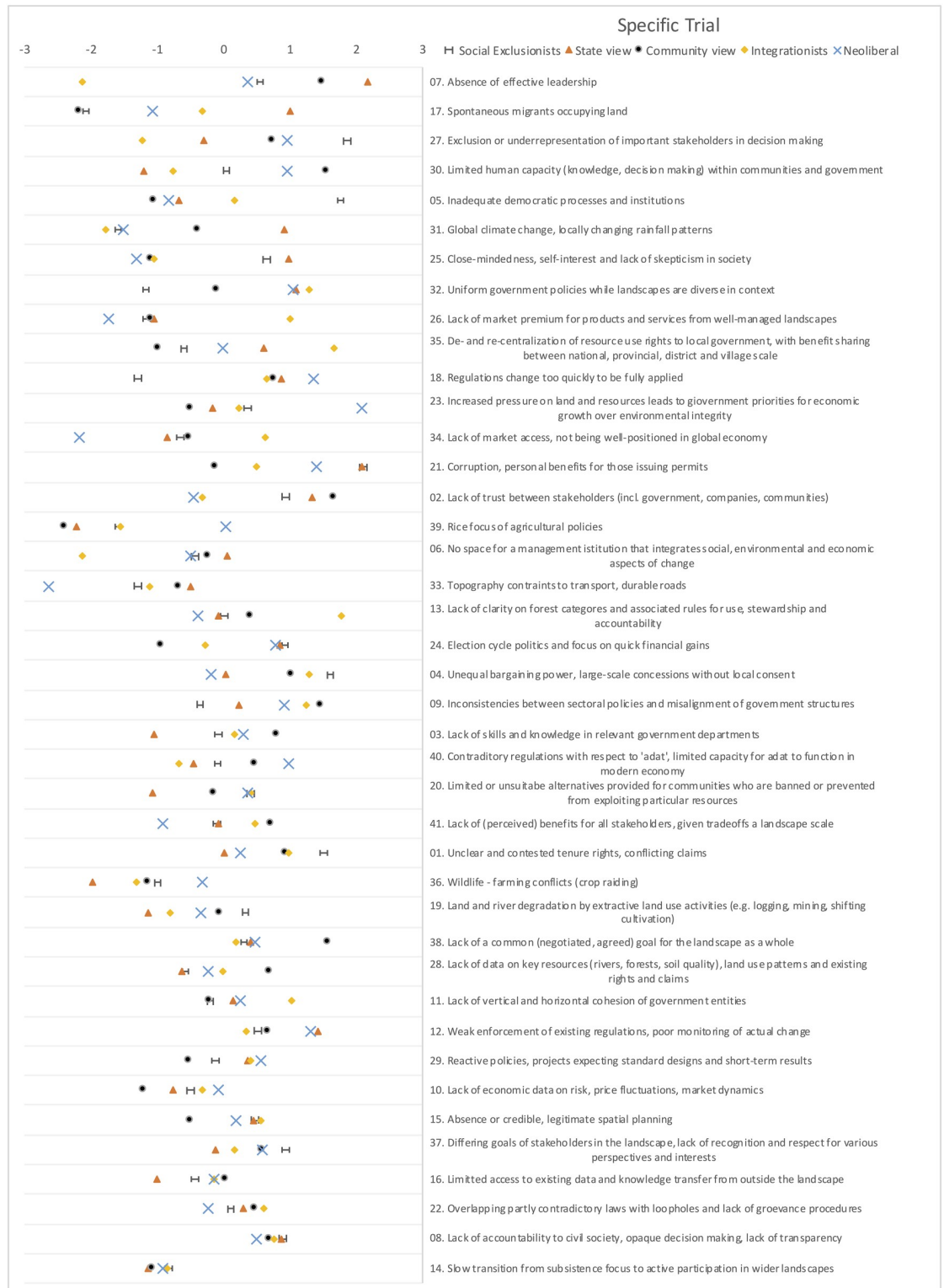
Fig 4. Q-statements and their z-scores for the landscape specific trial. Ordered from most distinctive at the top to most consensus at the bottom (based on z-score differences). Distinguishing statements that defined each discourse are found in S1 Table of the supplementary material.

https://doi.org/10.1371/journal.pone.0211221.g004