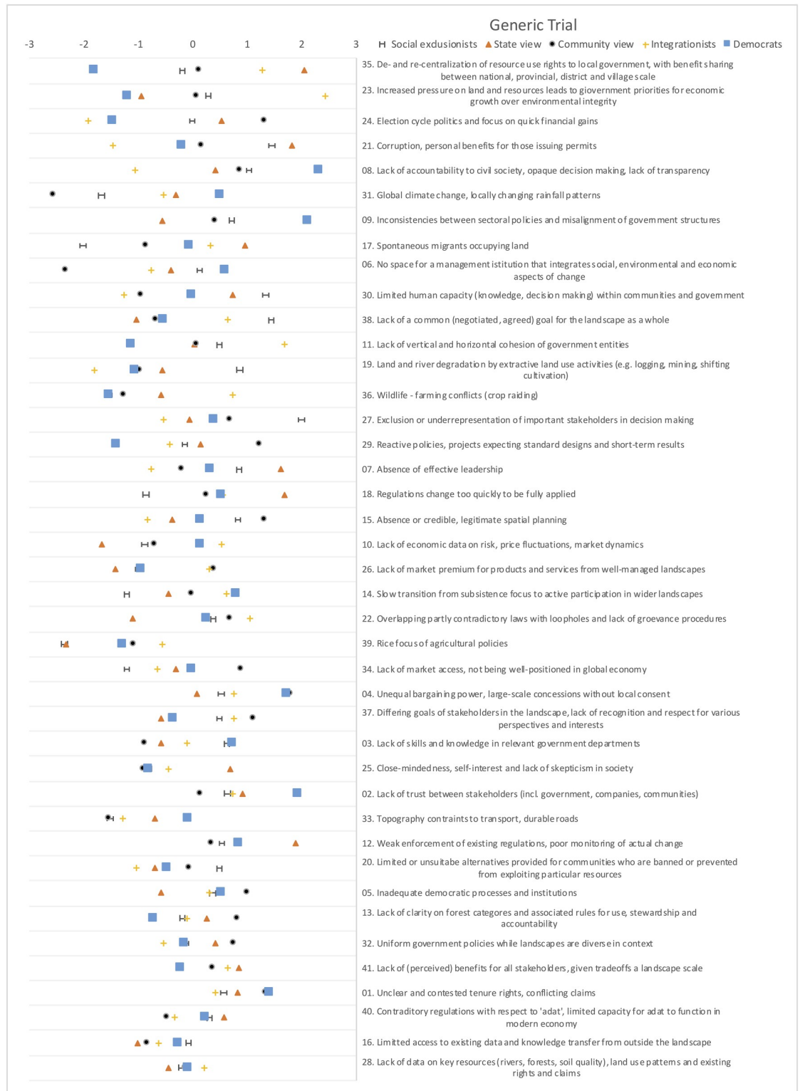
Fig 3. Q-statements and their z-scores for the general trial. Ordered from most distinctive at the top to most consensus at the bottom (based on z-score differences). Distinguishing statements that defined each discourse are found in S1 Table of the supplementary material.

https://doi.org/10.1371/journal.pone.0211221.g003