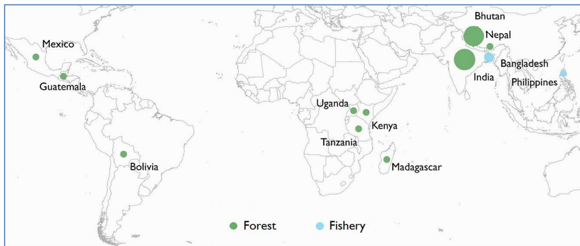
Fig. 2 Geographic distribution and categories of included studies with circles proportional to the number of included studies from a country (excludes one study [62] because its multiple-country and multi-sector results are presented in aggregate)

and two studies mentions high levels of political and/or economic inequality in a community as a negative influence [8, 56]. To reduce the influence of these factors, several studies use regressions models that control for the impact of factors other than gender and address the issue of omitted-variable bias [8, 17, 18, 53, 54].