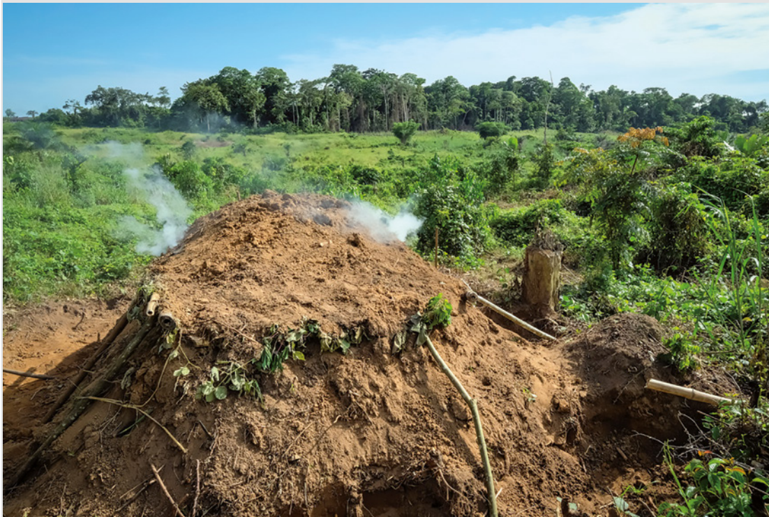
Photo 3. Charcoal kiln in Yangambi landscape. Photo CIFOR/A. Fassio 2017.

Facilitation of access to permits and simplification of taxation Linking technical requirements to sustainable sourcing and management plans, including tenure rights Creating awareness about improved charcoal processes among policy makers at different levels Lighting mechanism to monitor use of improved kiln techniques (e.g. self-monitoring/ peer-to-peer by cooperatives). Mechanism to incentivize more sustainably produced charcoal to compete with illegally produced charcoal