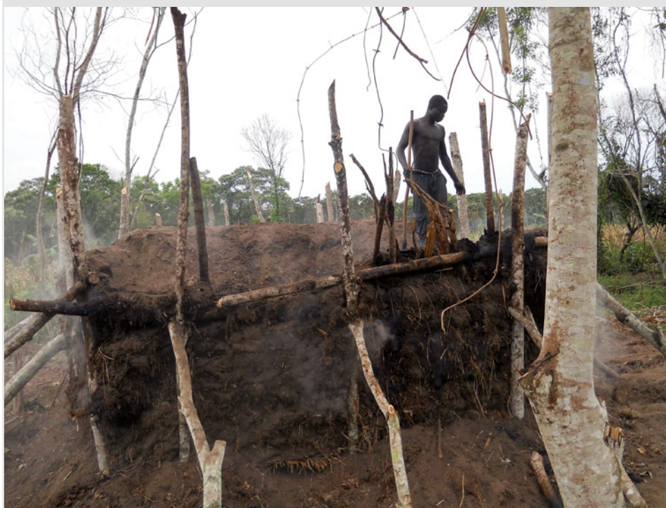
Photo 2. Charcoal kiln on Plateau Bateke, Makala Project. Photo D. Kalala, 2011.

In addition, the institutional framework contributes to shaping the enabling environment for providing incentives to efficient production methods and guidelines on preferred improved carbonisation techniques. Improved policies or financial mechanisms could include a stumpage fee or harvest quota, tax incentives, voluntary certification initiatives, or finance mechanisms such as through voluntary carbon markets or climate funds (FAO, 2017b; GIZ, 2015). Options for more sustainable charcoal require enabling policies, inclusiveness of more vulnerable actors and sustainably