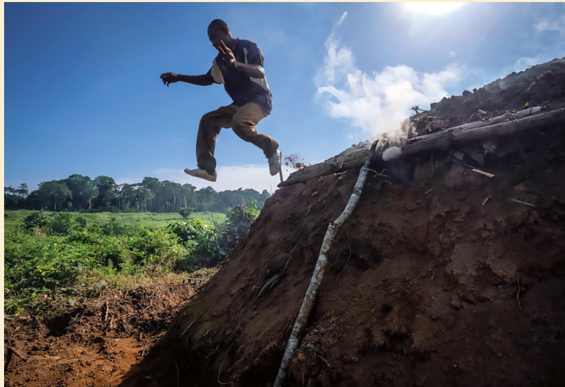
Photo 1. Solutions “beyond the kiln”? Kiln near Yangambi, Democratic Republic of Congo. 2017.

Doi : 10.19182/bft2019.340.a31691 – Droit d’auteur © 2019, Bois et Forêts des Tropiques © Cirad – Date de soumission : 11 juillet 2018 ; date d’acceptation : 2 novembre 2018 ; date de publication : 1 er avril 2019.