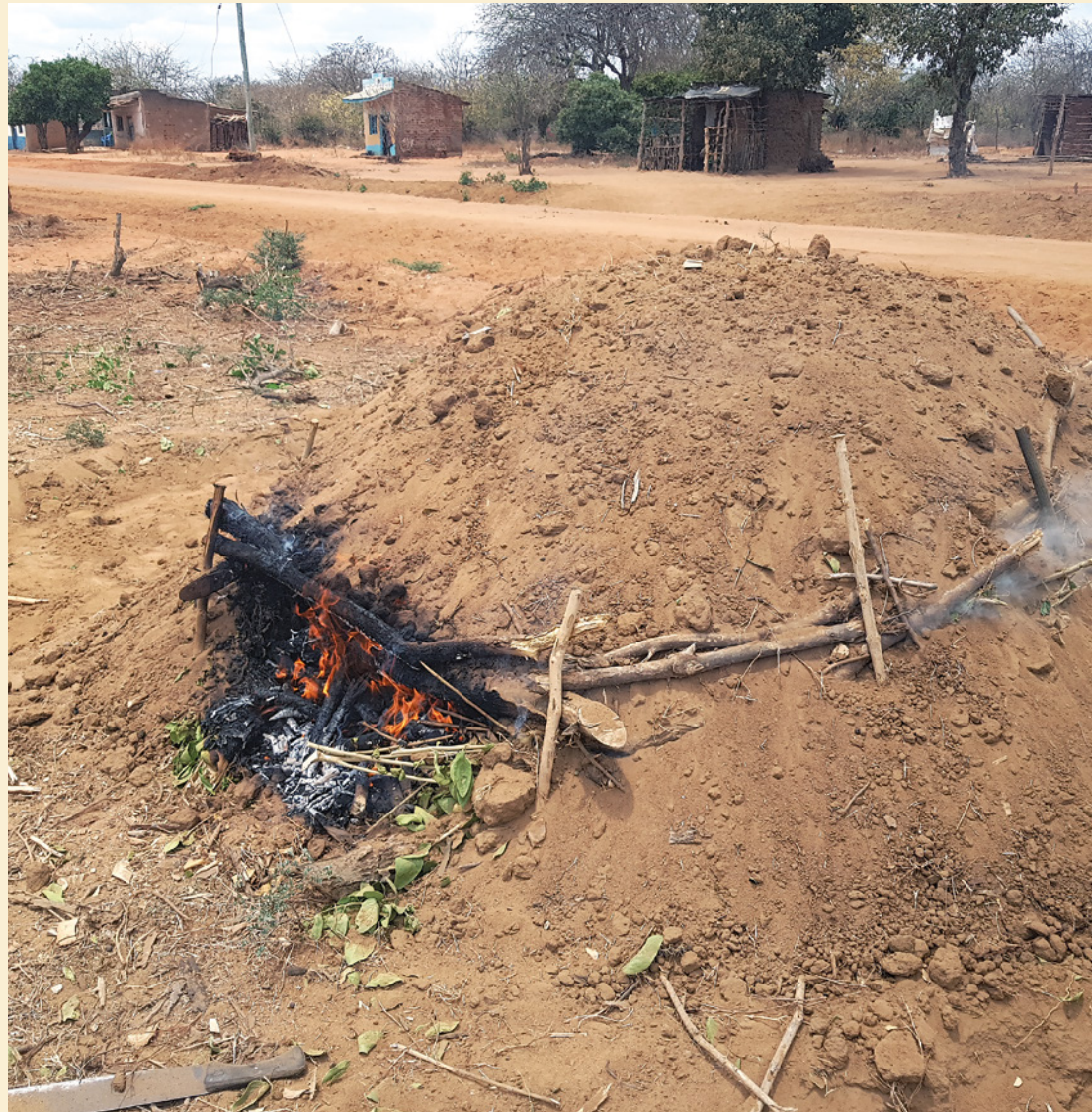
Photo 1. Traditional earth kiln by the roadside in Kitui East, Kenya.

Doi : 10.19182/bft2019.340.a31690 Droit d'auteur © 2019, Bois et Forêts des Tropiques © Cirad – Date de soumission : 11 juillet 2018 ; date d'acceptation : 2 novembre 2018 ; date de publication : 1 er avril 2019.