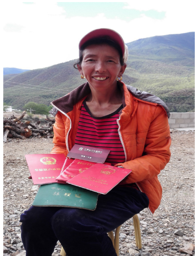
Fig. 2. Documents underpinning participation in the Conversion of Cropland to Forest Program A rural resident in Shangri-La county, Yunnan province displays her bankbook and certifications, including those clarifying forestland and grassland tenure rights. The Conversion of Cropland to Forest Program promoted the advancement of the institutions behind these documents into more rural and more marginalized areas of the country.

To implement China’s largest forest restoration program, the CCFP, the central government designed a highly articulated network for implementation, inspection and reporting across sectors and administrative scales. The resulting articulation of the program with sector ministries of, in particular, agriculture, land resources and finance, has both facilitated the program and supports parallel efforts in land tenure reform and financial inclusion ( Fig. 2 ). The number of rural participants enrolled and the targeted geography of the program is potentially a driver of more equitable development, which is likely an important factor of success in forest landscape restoration.