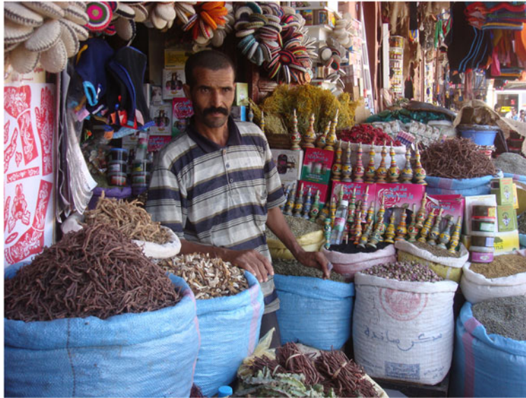
Figure 2 Bags containing single medicinal roots and herbal mixtures in the Marrakech herbal market.