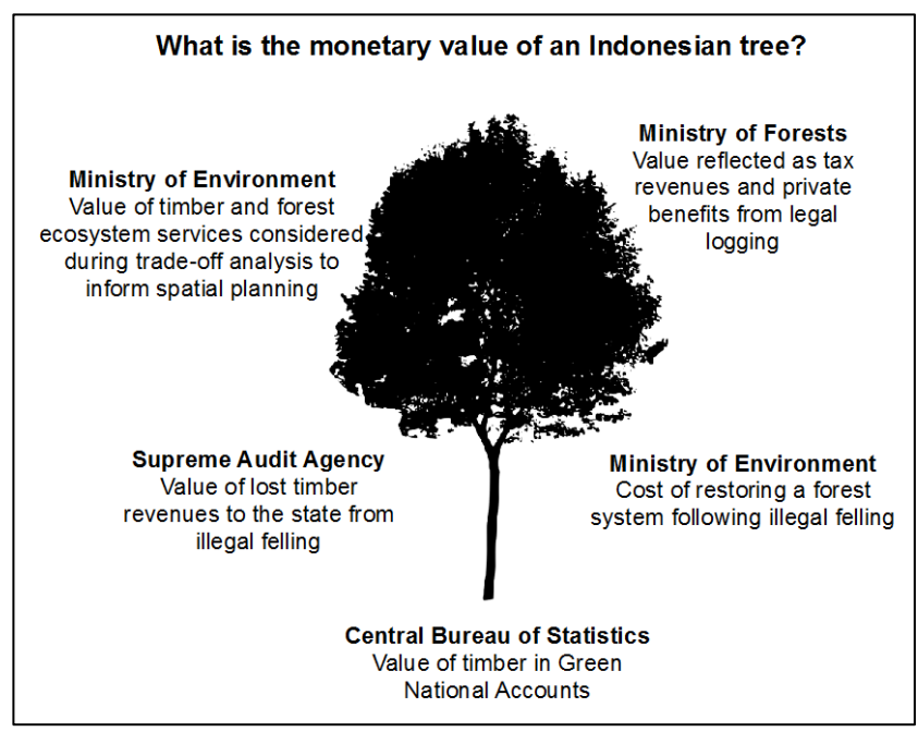
Figure 2. The economic value of an Indonesian tree in Indonesia varies across agencies

As a result, a courtroom case on illegal logging that uses valuation to estimate the scale of environmental harm would result in one set of monetary values. However, the same good and related services could be assigned vastly different value if calculated as part of a natural capital Green or GDP exercise, and yet another set of value as defined by the Forest Department or the State Auditors. At the same time, other approaches, such as those that account for non-material values, would deliver fundamentally different assessments. Disagreements over valuation approaches have already emerged in Indonesia, such between civil society and government over the calculations of state losses resulting from illegal resource extraction (e.g., MAPPI 2009). This diversity has profound implications for policy, budget and management, and thus for social and environmental justice.