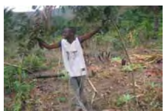
Photo 3 : Assisted Natural Regeneration applied by a farmer in a farm located on the Batéké Plateau (Province of Kinshasa, RDC)

The second phase is conducted during the weeding of crops. The farmer chooses stump shoots based on their relevance. After the harvest, the preserved and spontaneous plants will grow during the fallow cycle (5-12 years in the area concerned). The farmer