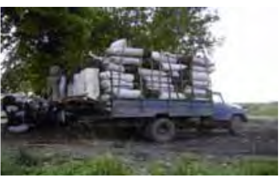
Photo 1 : Transportation of charcoal to Kinshasa (DRC)

The increase in the demand for wood energy in cities has exacerbated the pressure on forest resources in the region. This is of particular concern in view of the lack of incentives for the restoration or sustainable management of these resources. However, it ensures the livelihood of a large number of households. It was estimated that the total value of the wood energy market was worth 143 million dollars in 2010 (Schure J. et al., 2011), 3.1 times the value of national roundwood exports of 46 million dollars in 2010 (FAO, 2011). Over 300,000 people are involved in this informal sector (Schure J. et al., 2011), representing 20 times the number of persons (i.e. 15,000) working in the formal forest sector in the country (Eba'a Atyi R. and Bayol N., 2009). Most cashgenerating opportunities exist at the level of production (the share of income generated varies from 47% for fuelwood harvesters to 75% for charcoal producers). Wood energy related incomes largely complete the average income of households. These incomes generated by wood energy contribute to their basic needs and provide households with an investment capital (mainly in agriculture and, to a lesser extent, in small-scale activities such as cattle rearing and fishing). Urban households rely heavily on woodfuel (87% in Kinshasa). businesses such as Many bakeries, breweries, restaurants, and brick and aluminum factories also rely on wood energy for their daily operations.