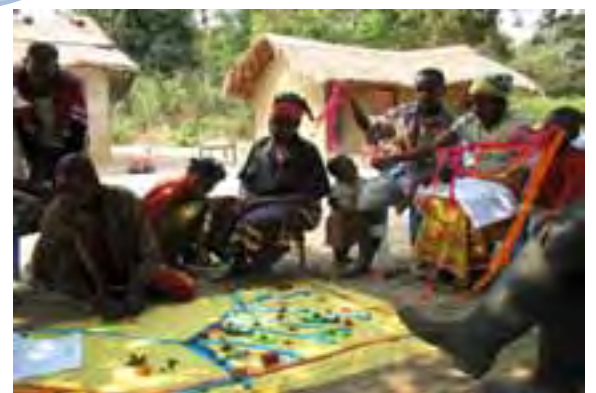
Photo 2 : Reproduction of Landscape Units using interactive models in the Kinduala village (Province of Bas Congo, DRC)