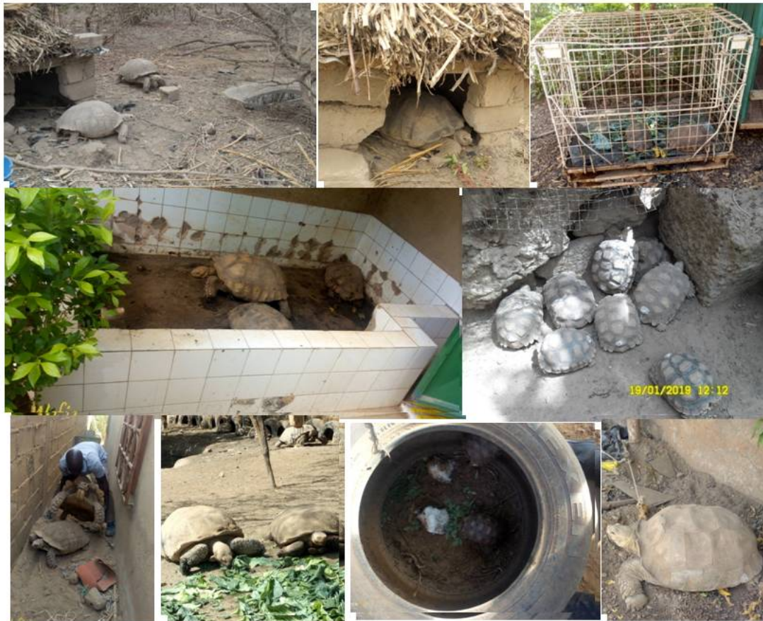
290 FIGURE 1. African spurred tortoises observed in captivity in Burkina Faso.