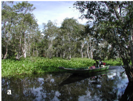
Fig. 4. a) Annually burned vegetation along a river, b) annually burned sedge floodplain navigable by boat, c) pool of water containing fish in a burnt forest.