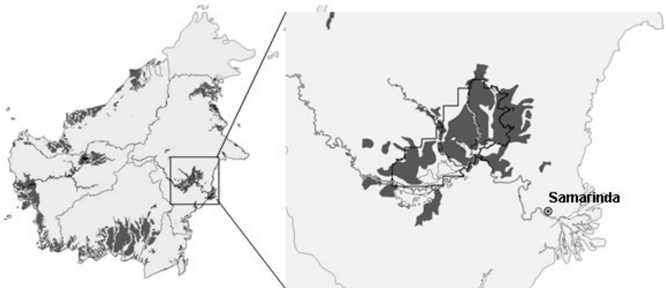
Fig. 1. Location of the Middle Mahakam Peatland study site along the Mahakam river in East Kalimantan. Dark patches are wetland areas of Borneo.