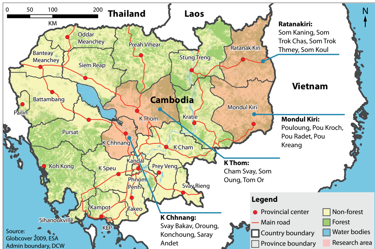
Figure 1. Map of Cambodia and location of the 16 research sites.