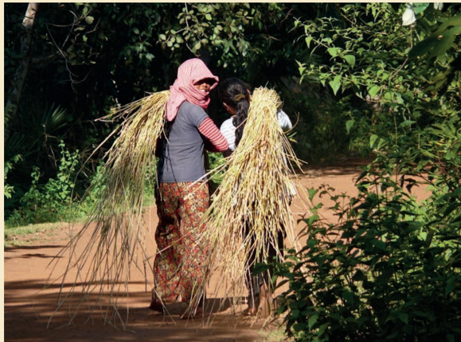
Photograph 1. Women taking home bunches of small rattan stems collected in Kampong Chhnang, Cambodia.

3 Community Forestry Unit Department of Forestry and Wildlife 40 Norodom Blvd. Phnom Penh Cambodia