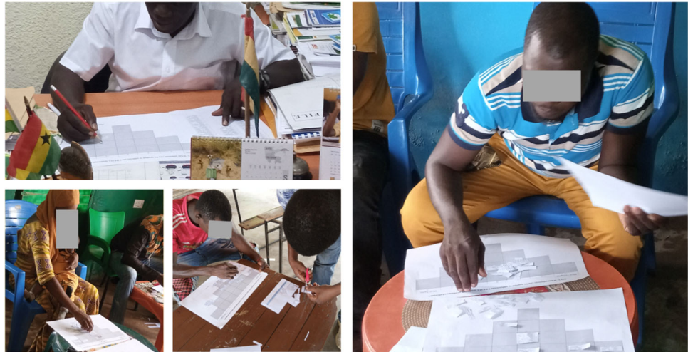
Fig. 2 Respondents sorting the statements. Photos: The author, 2021. Source: Field data, 2021

above criteria, three factors were retained for each Q-set (F1, F2, F3 for the Q-set related to RQ2 and F4, F5, F6 for the Q-set related to RQ3) (see Tables 5 and 6). The correlation of the factors for each Q-set revealed the distinctive and consensual statements (see Supplementary material, Appendices 3 and 4) related to each factor. Then, the factor loadings gave insight into the correlation between factors and respondents (Table 7). According to Schober et al. (2018, p1765), “cutoff points are arbitrary and inconsistent and should be used judiciously”. I used a conservative score of 0.7 or higher to flag off components in all responses since the correlations between variables were statistically stronger at this level to explain the association.