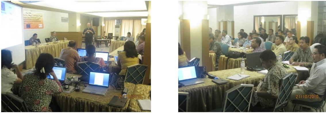
Figure 6. CoLUPSIA project presentation (Project Leader) and participants during the workshop

The final product from this project will be a model for land use mapping at a larger scale that includes the ecosystem conditions on Seram Island. Hence, we do not refer to the MoF criteria for big islands such as Kalimantan. The output of the key results from this project will be the work methods and land use model, which can be used as the main study results and to revise spatial planning areas, which is usually conducted every 5 years.