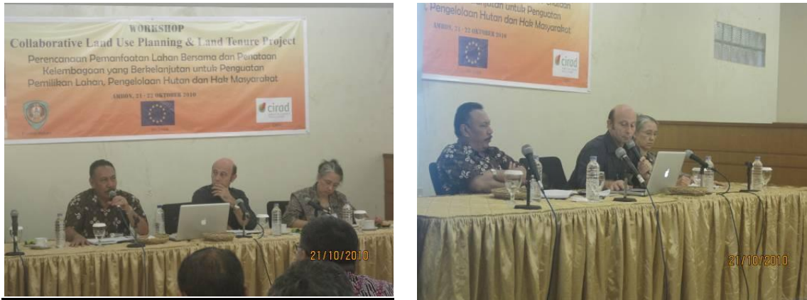
Figure 5. Head of Bappeda, CoLUPSIA Project Leader, and CIFOR scientist during the discussion session