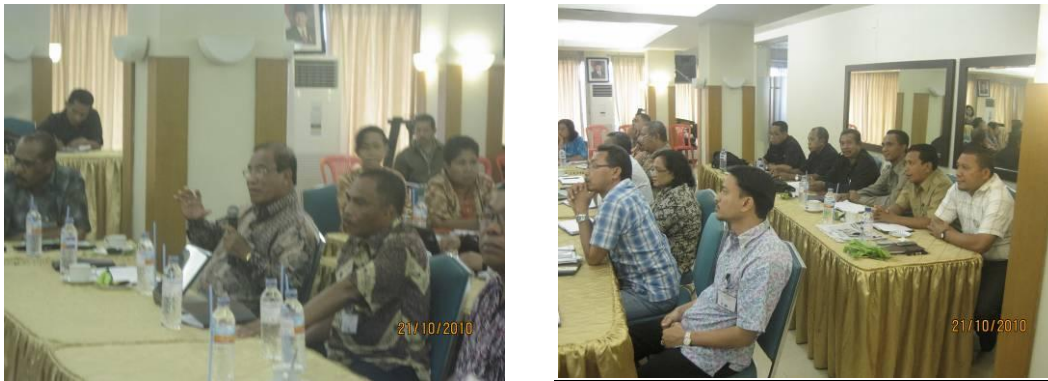
Figure 4. Questions and comments from participants

The following are responses from the presenters regarding the entire questions, comments, and suggestions from the participants during the discussion session. A detailed list of questions is available in the Annex 3.