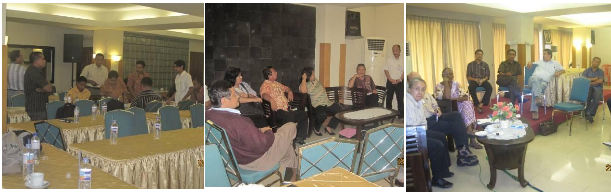
Figure 3. Working group on identification of stakeholders

How to conduct a stakeholder analysis? There are two important factors needed: 1). Identification of roles and 2). Identification of position