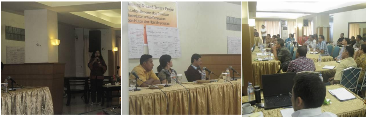
Figure 7. Presentation results from the group discussion and participants during the workshop

Nevertheless, many participants showed their interest in this project and were willing to support and to collaborate in the implementation.