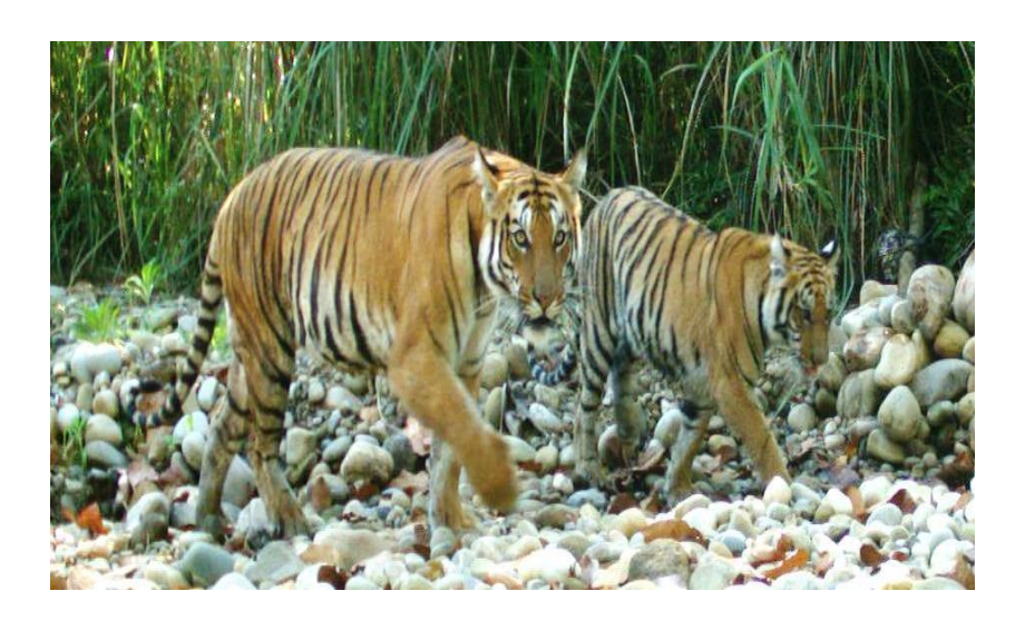
Figure 3. Tiger capture in 2013 from camera records in Chitwan National Park