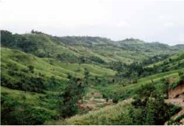
Figure 4. Imperata cylindrica (alang-alang) grassland in an abandoned forestry concession within a government-designated production forest in West Kalimantan, Indonesia. After abandonment by a parastatal concession, the area was rapidly cleared by swidden farmers, then invaded by pyrogenic grass and subjected to frequent fires. The Ministry of Forestry still claims the area as part of its forest estate.

Some of the present deforestation threats in tropical production forests can be traced back to when governments first gazetted lands without regard to the seemingly legitimate land claims of local people (e.g. Sears and Pinedo-Vásquez 2011; Hecht et al. 2014). While the criminalization of traditional land uses is unethical, clear conflicts between production forestry and traditional agriculture are often yet to be addressed. For example, forest concessions in Kalimantan (50,000–150,000 ha), Indonesia, typically host 5000–10,000 people in 5–15 villages (Ruslandi et al. 2015). Concessionaires are expected to negotiate with these people and do so in various ways with various outcomes. Unfortunately, cultural, linguistic, religious and power differences characterize the negotiations, which are plagued with misunderstandings. Given the acceleration of tropical forest concession granting and the apparent deceleration of tenure granting to rural people (Corriveau-Bourque et al. 2014), avoiding such misunderstandings is a paramount concern. Despite the deficiencies in company-community relations, the widespread and rapid clearance of forests by swidden farmers when concessions are abandoned suggests that the negotiated agreements between concessionaires and villagers are at least somewhat effective in slowing deforestation. Where forestry operations serve as a magnet for forest colonists, the challenges