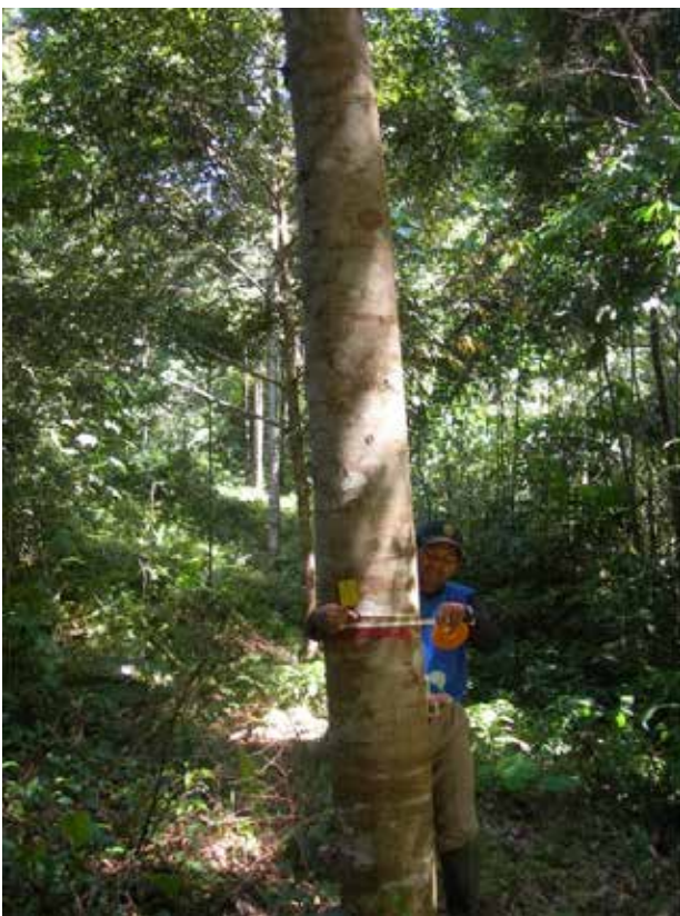
Figure 8. Enrichment planting along cleared lines through twice logged forest. The planted trees ( Shorea leprosula ) were 15 years old and mostly 25–35 cm diameter at breast height (DBH) when this photo was taken (Photo by Ruslandi).

Given the great variation in what passes for RIL, it is important to provide some details about SBK's approach. The company carries out 100% stock mapping of trees >40 cm DBH and produces its own topographic and stock maps based on data collected by its inventory crews. Based on these maps, roads and skid trails are pre-planned.