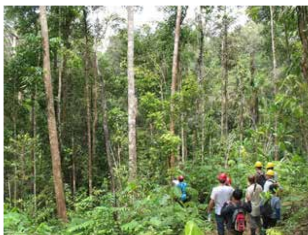
Figure 5. A felling gap filled with natural regeneration of commercial tree species. Nine months before the harvest, the inventory crew cut the lianas on the trees to be felled, which reduced incidental harvest damage and limited post-logging liana proliferation (Photo by V Medjibe).

While not questioning the fundamental goals of RIL, given the variety of silvicultural approaches needed for the wide range of tropical forest species and conditions, it would have been clearer if the acronym was RUIL, for ‘reduced undesirable impacts of logging.’ This modification would clarify that in some cases, substantial impacts of logging are silviculturally desirable. For example, where the objective of a silvicultural intervention is regeneration of light-demanding tree species, slavish attention to traditional RIL renders the intervention no better than high-grading (Fredericksen and Putz 2003). Instead of trying to minimize stand damage, special efforts might be required to achieve the desired amount of canopy opening and skidder drivers might be encouraged to scarify the soil surface in logging gaps to expose mineral soil. The root of the problem is that most RIL guidelines were devised with single tree selection in mind whereas that approach is inappropriate for many stands in the tropics.