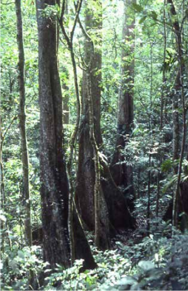
Figure 2. Primary tropical rainforests with clusters of large trees with big buttresses might not be a suitable reference condition against which to evaluate the impacts of silvicultural treatments on the structure (e.g. standing stocks of timber) and composition of forests managed for profitable yields of timber.

least typical cutting cycle durations (e.g. 25–30 years), then at least some of the traits of primary forests will unavoidably and intentionally be lost under the required silvicultural regime (e.g. Dauber et al. 2005; Peña-Claros et al. 2008). The required interventions will cause even greater departures from the primary forest reference state if the main commercial timber species are light-demanding (Fredericksen and Putz 2004). These interventions (e.g. liberation thinning, soil scarification and enrichment planting) are implemented for the expressed purpose of changing forest composition to favor trees of commercial species (de Avila et al. 2015). Unfortunately, at least from a timber yield perspective, these silvicultural treatments are seldom applied outside of the experimental plots where they were shown to be effective.