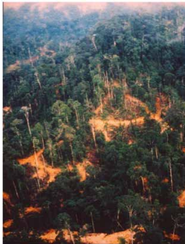
Figure 7. Switchbacks cut with a D-7 bulldozer up a steep hillside in Sabah to access timber (Photo by M Pinard).

In recognition of the effects of slopes on the impacts of land-use activities, many environmental guidelines set by governmental and non-governmental bodies try to address this. Unfortunately, many fail to indicate the slope lengths or the areas over which slopes should be measured, which renders them ineffective because average slopes decrease with the area over which they are averaged. This means that slopes measured with digital elevation models based on remote sensing always decline with increasing size of the pixels used. Disregard of this pixel problem is evident in numerous publications and policies, of which we highlight only one. In an otherwise excellent paper by Austin et al. (2015), the authors conclude that oil palm plantation operational costs in Kalimantan are not influenced by slope probably because their digital elevation model was based on 250 m pixels. Another operational problem is that slopes measured by field crews or with LiDAR are steeper than those based on passive remote sensing