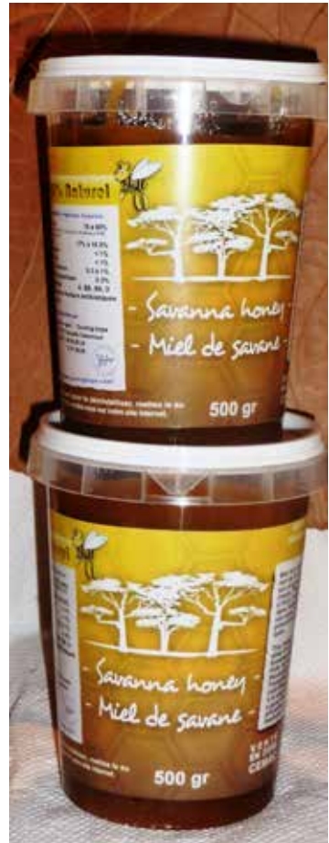
Photo 5. Honey jars packaged by processing enterprise Guiding Hope

redesigned their packaging so that it can be more easily transported and make a better impression on consumers in large cities (Photo 5). Profits can be up to 25% higher, compared to the previous packaging in reused bottles. Producers must assess the characteristics of the packaging material and whether it is appropriate for the market.