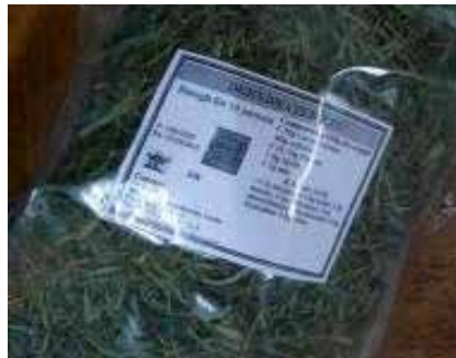
Photo 4. Dried eru packaged by processing enterprise MISPEG in Cameroon