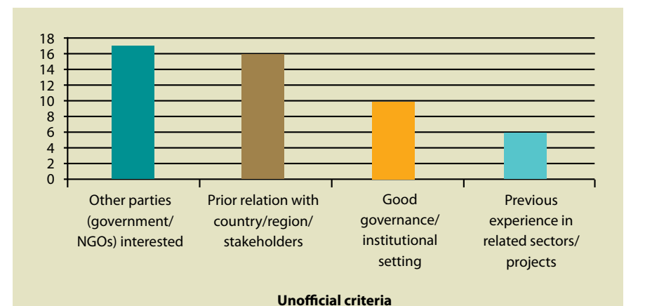
Figure 21.2. Unofficial criteria for REDD+ activity location selection

In practice, existing sustainable forest management and integrated conservation and development projects (ICDPs) underlie many of the criteria, because they are why other parties are interested, prior relationships have been established and prior experience gained. In fact, many REDD+ activities are really extensions of existing ICDPs, whose locations were determined largely by biodiversity, conservation and development goals, with carbon benefits at best a secondary consideration.