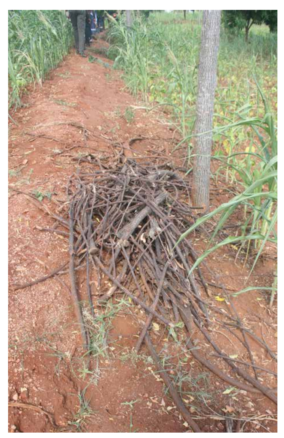
Prunings of another tree species (Melia volkensii - mukau), also to be used for firewood. The importance of firewood and where it comes from, is vastly underestimated by policy makers, and even by the consumers themselves, mining their environment for ever more branches to be able to cook, degrading their livelihood in the process.

Trees provide (a) biological products including (i) food such as fruits, nuts, vegetables, (ii) livestock feed such as pods and leaves, (iii) medicine and pesticides, (iv) oils, gums, resins,