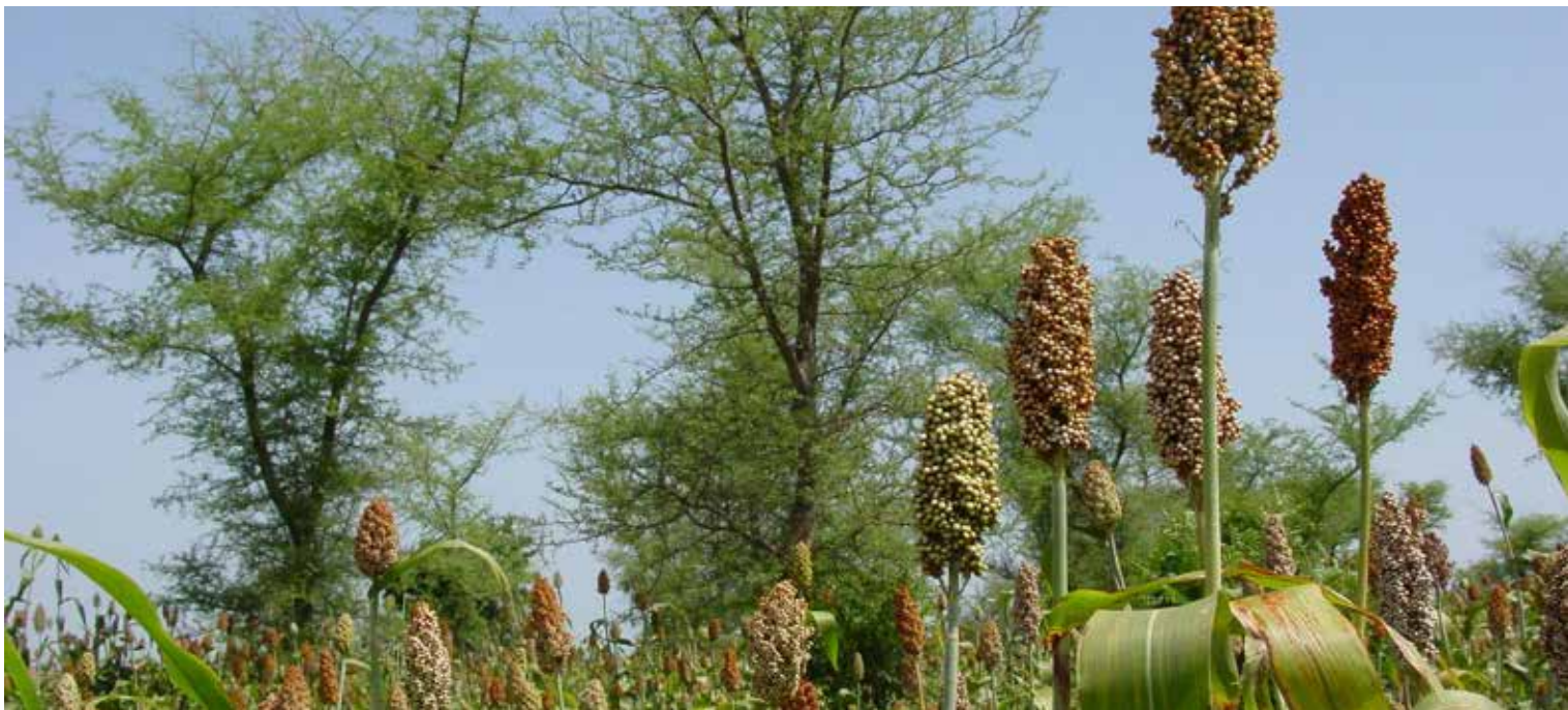
Sorghum just before harvest, in a faidherbia parkland at the end of the rainy season (October) on the Fadaré Dune, Far North Region, Cameroon; the faidherbia trees have just regained their foliage, but the shade will not reduce the upcoming harvest. On these poor sandy soils, but well supplied with deep water, only millet can be grown in treeless plots, while sorghum, which is more demanding in terms of fertility, can grow only under the trees.

Similarly, in a recent updated review of the sustainability of Faidherbia albida -based agroforestry in sub-Saharan Africa, Sileshi et al. (2020) showed that maize and sorghum productivity increased by 150% and 73% respectively under the faidherbia canopy compared with the canopy-free zone.