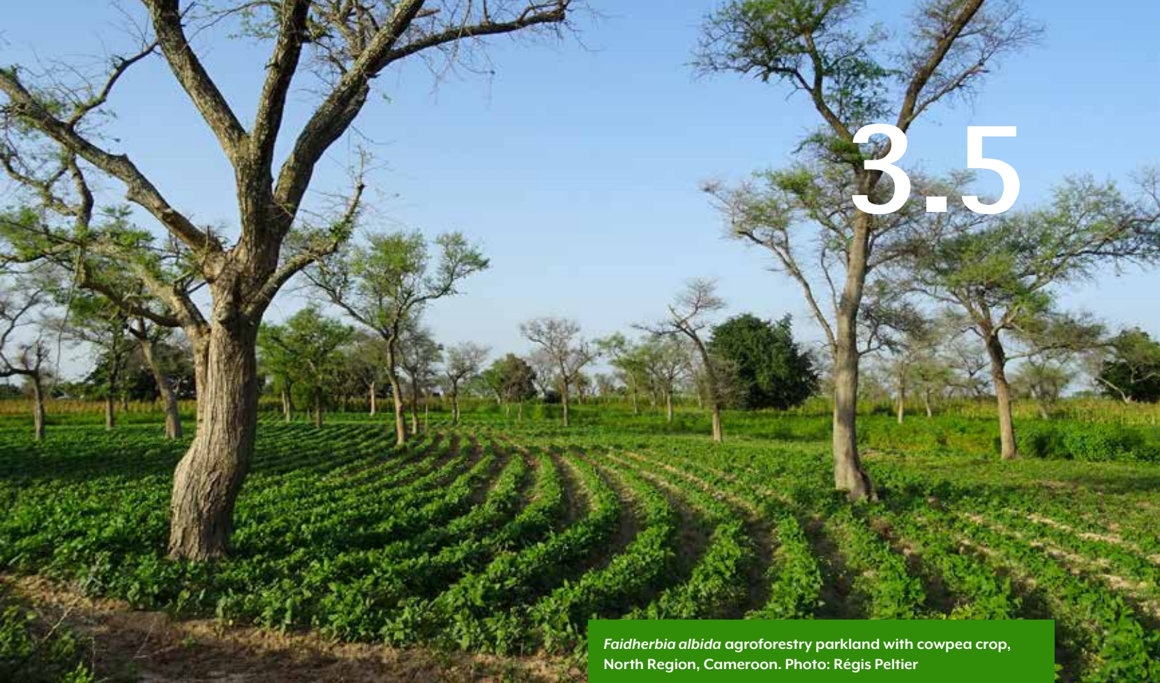
Faidherbia albida agroforestry parkland with cowpea crop, North Region, Cameroon.