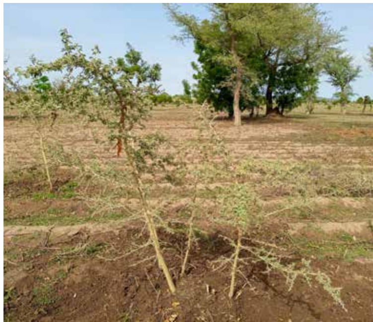
Left: At the end of the dry season, a clump of Faidherbia albida . Right: The same clump after the farmer selected four shoots; the following year he will keep only two shoots, then one in year 3.

Faidherbia albida , formerly known as Acacia albida , is a member of the legume family. It is one of the most suitable and the most recommended tree species for FMNR in areas that are favourable for it, in particular, those with sandy alluvial soils and a shallow water table in the dry season (10–50 m). Where it is not naturally present, planting it is possible, but is much more expensive: at least XAF 1,000 (Central African franc; EUR 1.50) per tree planted instead of XAF 100 per tree (EUR 0.15) protected by FMNR.