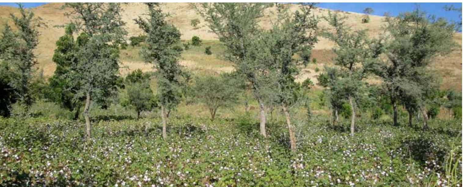
Cotton growing in a faidherbia parkland.

development and a higher average cotton weight were observed. In old parklands with very large trees, however, shade can become a limiting factor in cotton production. Even though faidherbia has an inverted phenology (leafing out in the dry season and defoliating in the rainy season), all the branches intercept some of the sunlight. It is therefore recommended that large crowns be pruned and old trees replaced by young seedlings selected by FMNR.