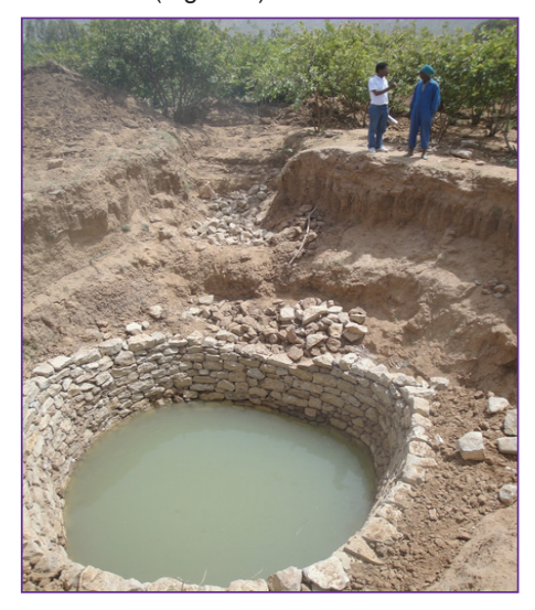
Figure 2: Round water well in Abreha Wa Atsbeha

the upper part of the watersheds contribute to the amount of ground water recharged in the lower part of the catchment. They explained conservation and re-greening activities in terms of what they call "the water bank" (Figure 2).