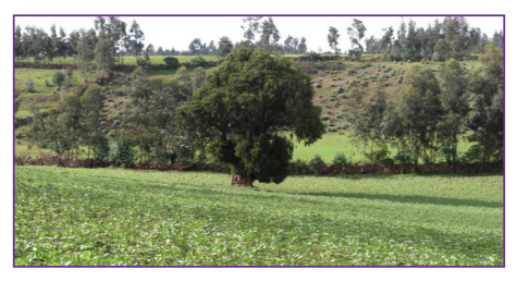
Figure 6: Juniperous procera on a cultivated field in Arsi

Farmers in Arsi, Bekoji, also explained that the impact of trees on crops and pasture through competition vary from species to species. Eucalyptus, although currently expanding in the region, was identified as the most competing tree for water and nutrients. One farmer noted "... it [eucalyptus] depletes all the water for other uses; if planted next to water sources, it makes the water to dry up; if planted next to crop land, it has to be at least 10m away since the poison from its roots and leaves reduce crop production significantly."