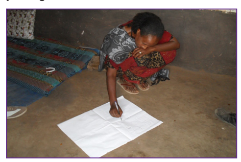
Figure 5: A female farmer in Abreha Wa Atsbeha drawing a farm resource map

In Arsi, Bekoji, biophysical conditions were different from that of Tigray, and farmers' knowledge of ecological processes differed too. Productivity in this study site had not yet begun to show a severe decline.