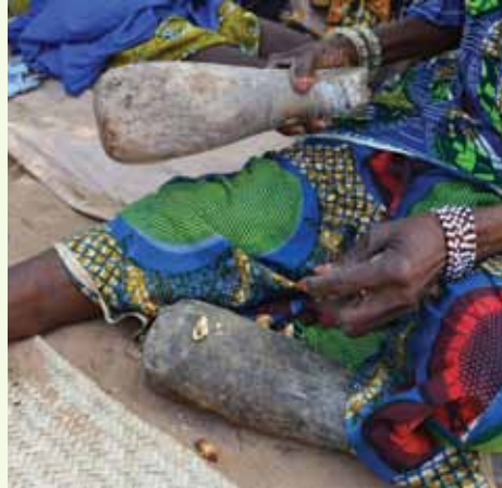
Cracking Balanites seeds requires time and patience.

The women are helping Tougiani and his colleagues to collect different provenances of Balanites , which are now the subject of research in local nurseries. Eventually, it is hoped that this participatory domestication programme will provide villagers with vigorous saplings to plant in their fields.