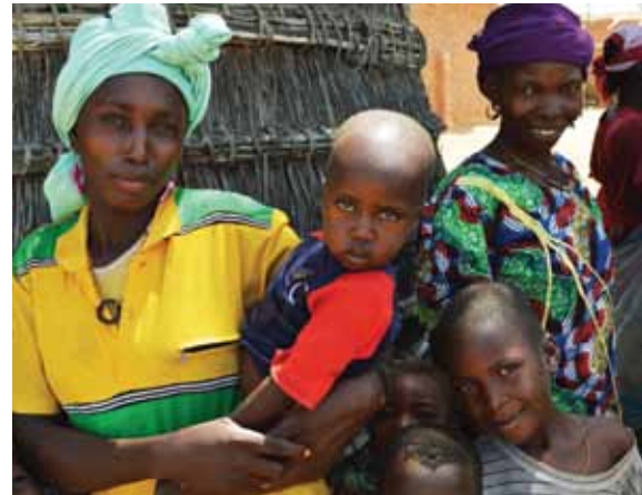
These women in Dan Saga have benefited from better crop yields, thanks to the regeneration of their parklands.

Such were the benefits, which are described in the next chapter, that Rinaudo continued to promote the practice during a series of drought-related famines in 1984 and 1985. In return for ‘food-for-work’, farmers in over 100 villages agreed to prune and conserve regenerating trees in their fields. In the area where SIM operated, 88% practised some form of natural regeneration, adding around 1.25 million trees to the landscape each year. Word began to spread from farmer to farmer, and towards the end of the decade farmer-managed natural