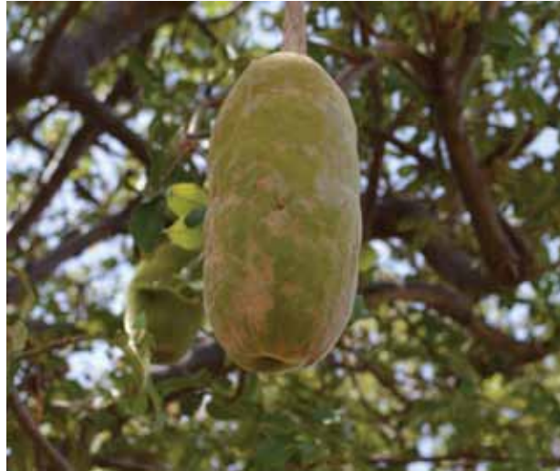
Baobab fruits are highly valued for the juice they provide.