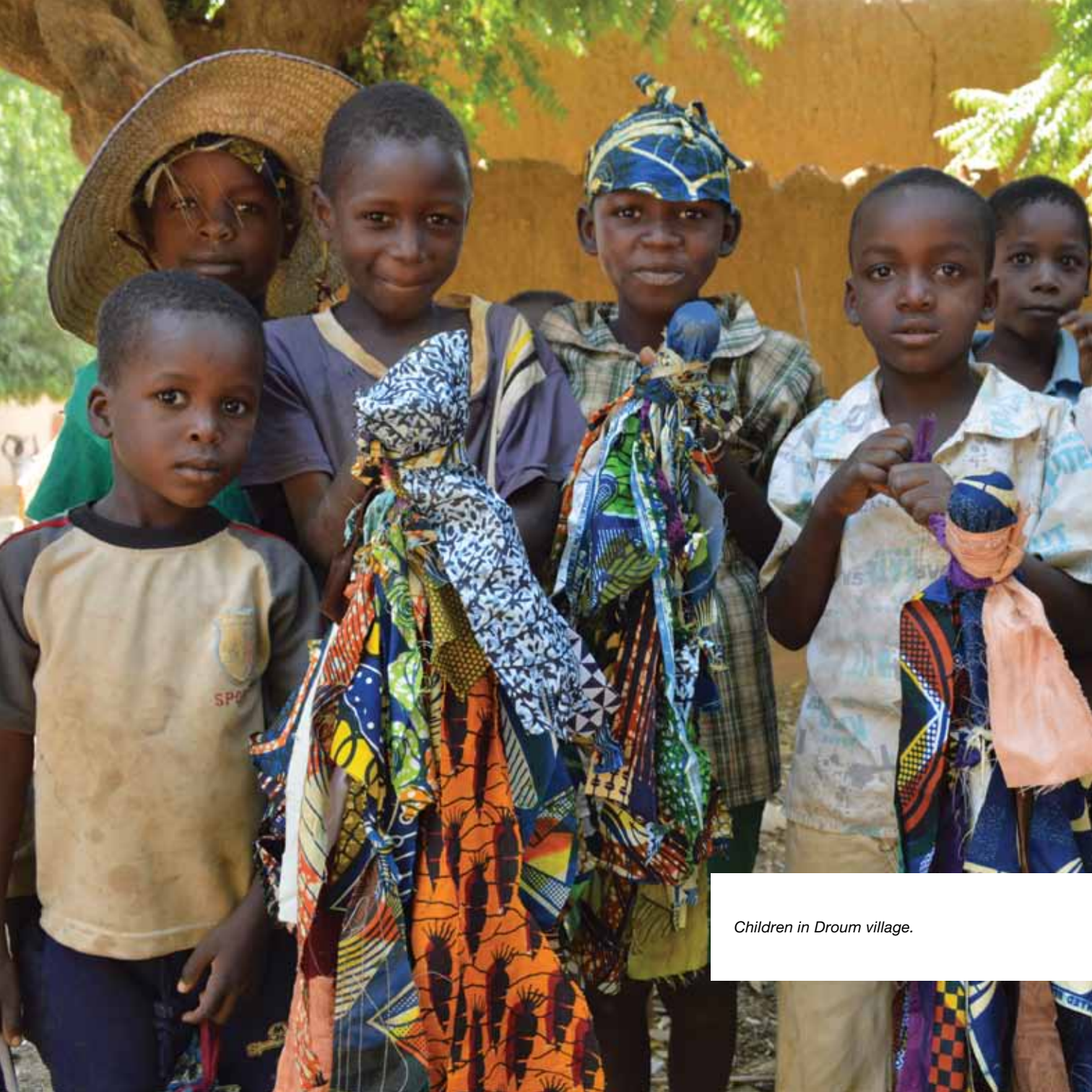
Children in Droum village.