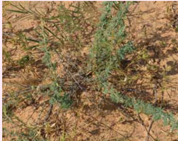
Farmers are now protecting shoots like these.

Farmer-managed natural regeneration – la régénération naturelle assistée in French, sassabin zamani in Hausa – is a practice which involves identifying and protecting the wildlings of trees and shrubs on farmland. It depends on the existence of living root systems and seeds. Shoots from roots grow more rapidly than saplings from seed, and they make up the bulk of the protected woody matter on farms in southern Niger. Farmers will generally choose five or so of the strongest stems from stumps they wish to retain on their land, pruning away the remainder. These stems can periodically be harvested to provide firewood and timber. Farmers will often allow one stem to develop into a full-size tree. The species favoured vary from place to place; so does the density of trees. Some projects have advised farmers to keep 40 trees per hectare, but densities of over 150 are not unusual.