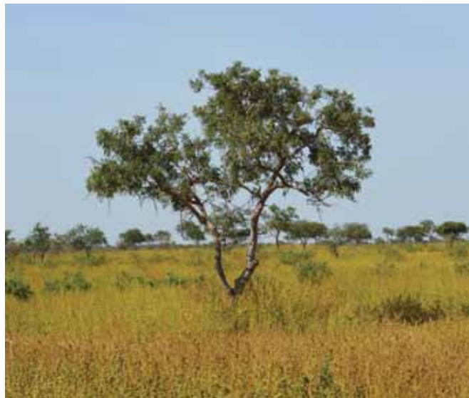
Uncontrolled grazing and wood cutting in Dankada-Dodo Classified Forest have led to the proliferation of the weed Sida cordifolia.