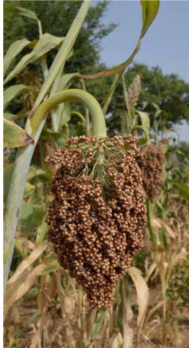
A fine harvest of sorghum in a field with Faidherbia.