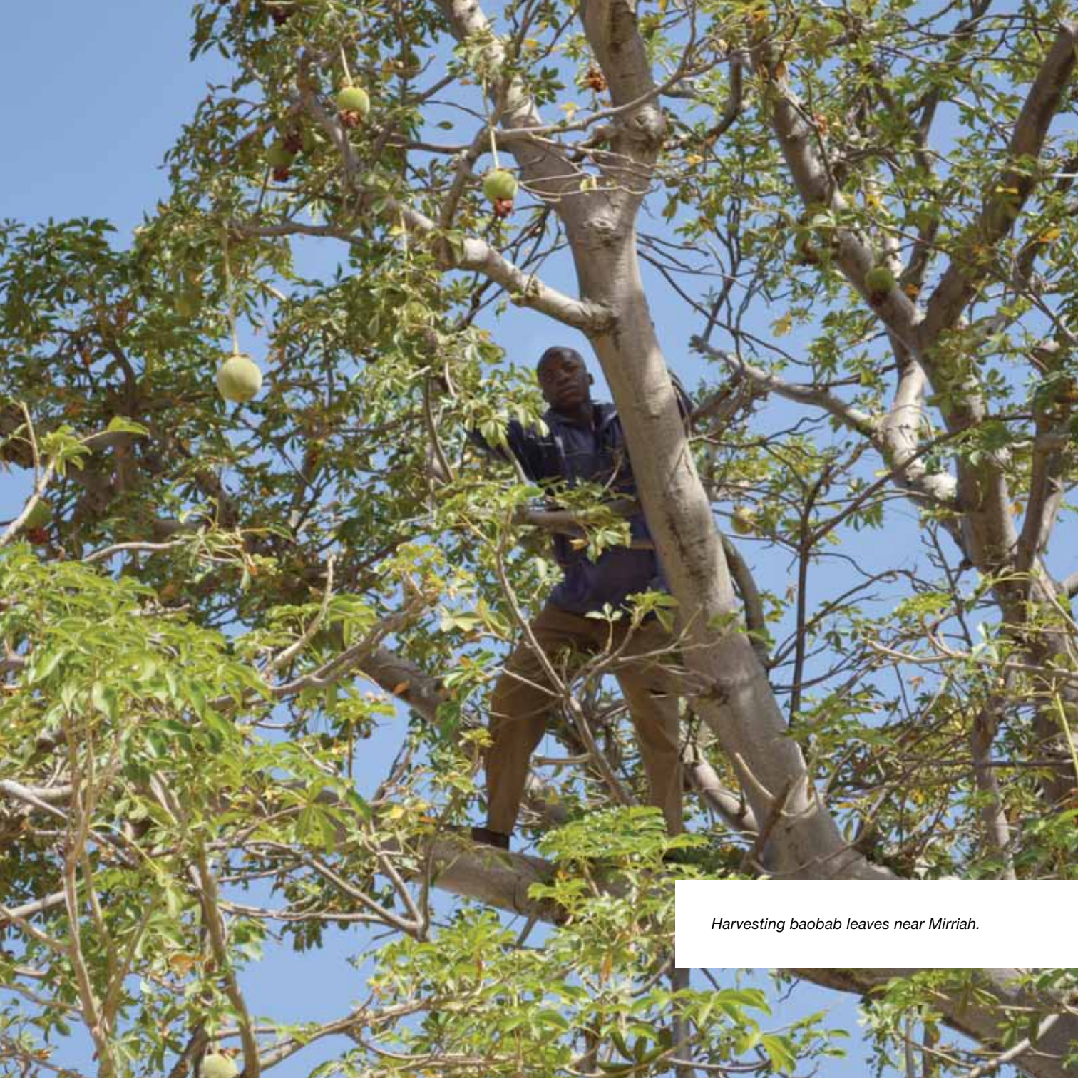
Harvesting baobab leaves near Mirriah.