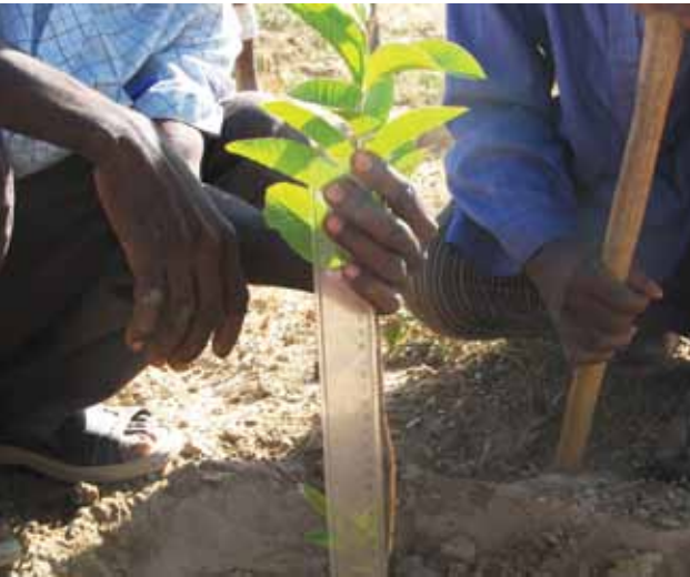
Villagers have played an important role in establishing and managing tree nurseries under various development projects.

partners, and put them on an equal footing with local government departments, researchers and everyone else involved in the project,” he says. This inclusive approach has been central to the success of the two most recent initiatives funded by IFAD in Aguié: le Projet de Développement Rural de l’Arrondissement d’Aguié (PDRAA) and le Projet de Promotion de l’Initiative Locale pour le Développement à Aguié (PPILDA).