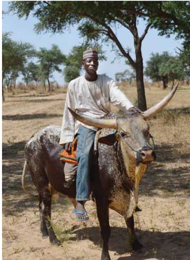
This is the traditional form of transport for many farmers.

In many Faidherbia -rich areas farmers are practising natural regeneration. They protect and prune the shoots which rise from underground roots and they place thorn fences around self-seeded saplings to protect them during the dry season, when pastoralists have the right to graze their livestock wherever they wish.