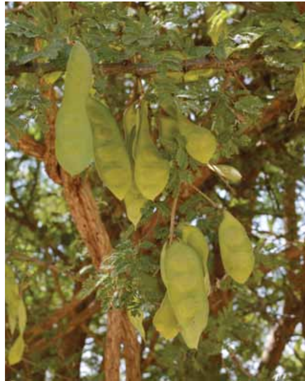
Seed pods from leguminous trees are often used as livestock fodder.

It has been suggested that increases in rainfall in the Sahel over the last two decades stimulated the process of re-greening. However, recent studies indicate that the relatively modest increase in rainfall has been insufficient to explain the scale of change in vegetation cover in southern Niger. The process, in short, has been largely driven by human intervention of one sort or another.