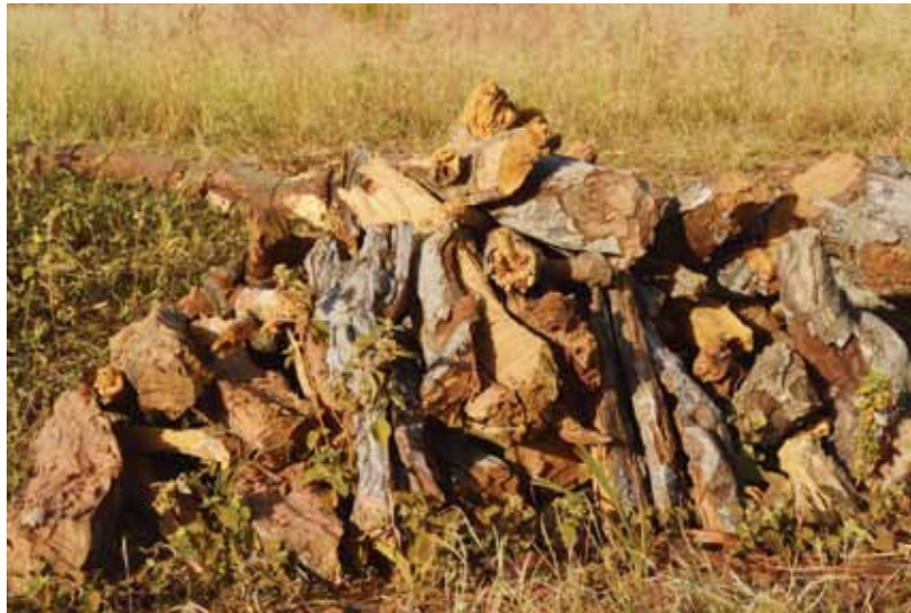
Natural regeneration has provided farmers with timber and fuelwood to use and sell.

During recent years, many villages have established wood markets, and these are proving a considerable success. In Dan Saga, for example, a market was established in January 2008. Wood is collected at the roadside from farms and sold in the centre of the village. This is not a free for all, and community organizations have established rules about which species can