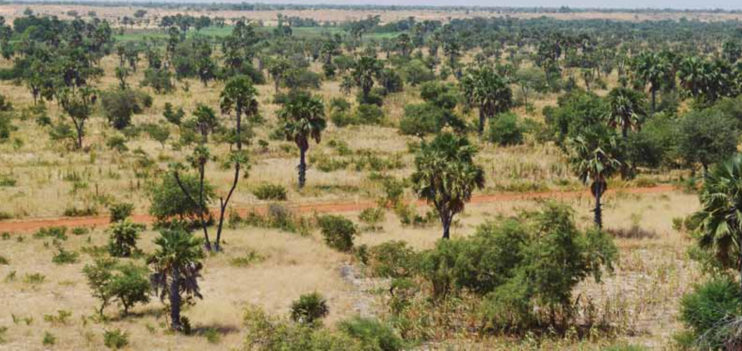
A typical parkland landscape at the end of the harvest season in southern Niger.