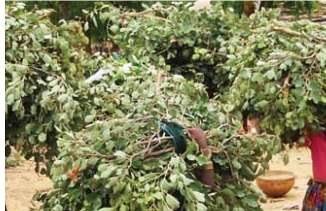
During the dry season, fodder from trees helps to sustain livestock.

In Dan Saga, for example, increasing numbers of villagers began to encourage natural regeneration in their fields. Before long, the benefits – especially the increase in wood products – were obvious; so obvious, in fact, that neighbouring villagers began to steal their firewood. This prompted the chief to set up a general assembly and the villagers agreed to establish surveillance committees with powers to arrest anybody who was found stealing firewood or timber. Over the years, the farmers here benefited from training provided by INRAN, the World Agroforestry Centre and a succession of projects funded by IFAD. There has been a strong emphasis on establishing institutions to promote natural regeneration and ensure that the trees and bushes are well protected.