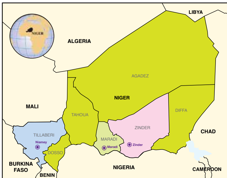
Most of the research on farmer-managed natural regeneration in Niger has focused on the regions of Maradi and Zinder.