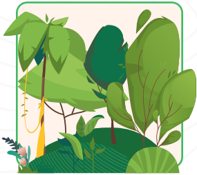
Area of land under restoration