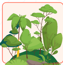
Tree cover and type