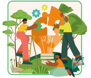
Communication and knowledge