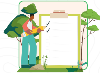
Policy and advocacy