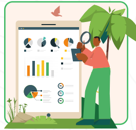
Restoration project data