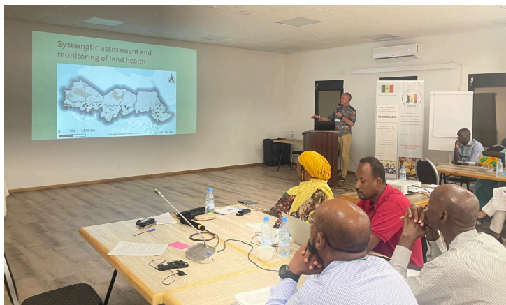
Table 1.4: Day 2 of the Week on the Great Green Wall Agenda

The focus for Day 2 of the Week on the Great Green Wall was on capacity and knowledge exchange of different approaches to monitoring land health. Representatives from various stakeholder groups, including the FAO, UNCCD, PA-AGGW, Birdlife International and CIFOR-ICRAF, delivered presentations on this theme. Table 1.4 below lays out the agenda for Day 2.